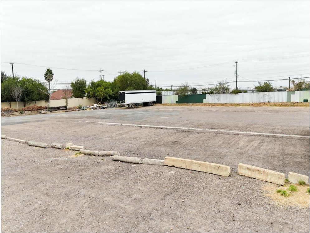
Available space ground view