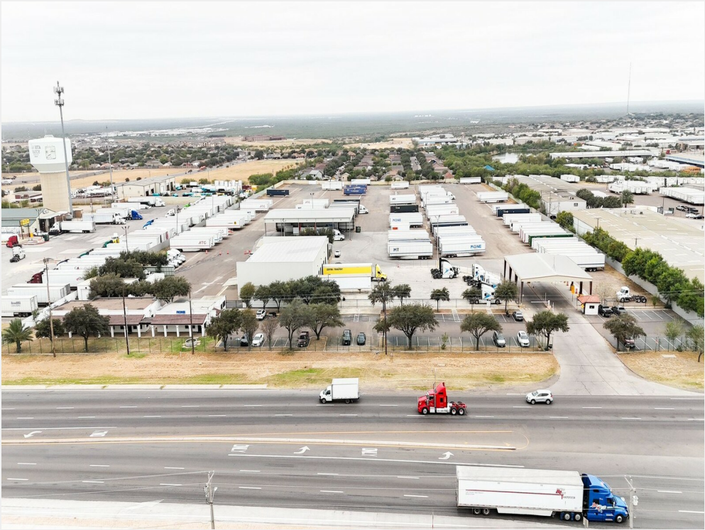
Front aerial drone view