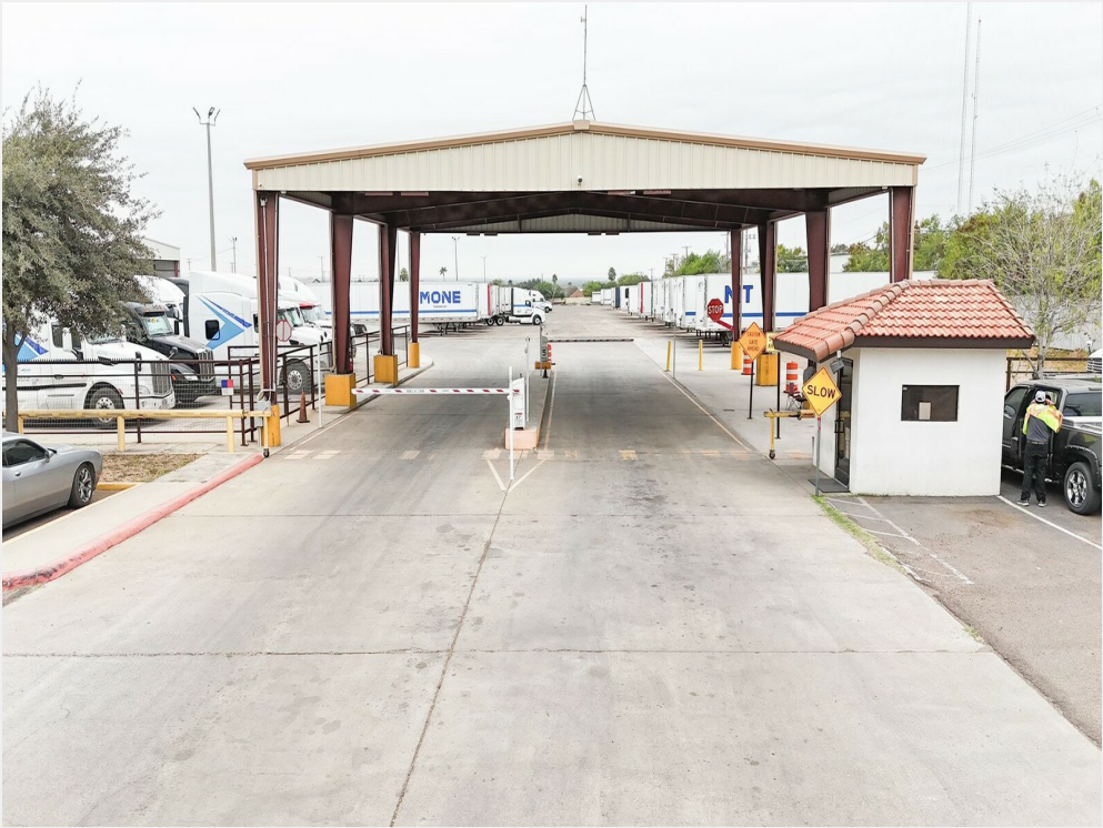
Security guard quarters