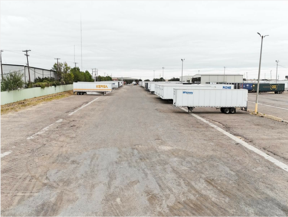
available space ground view