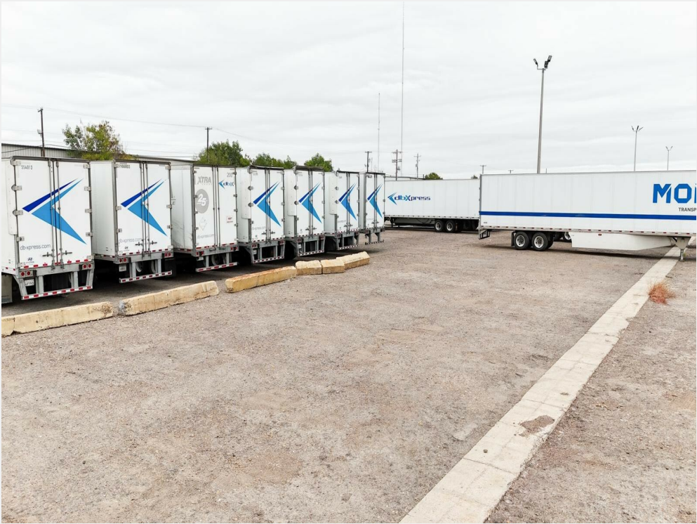
Available space ground view