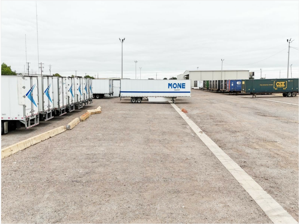
Available space ground view