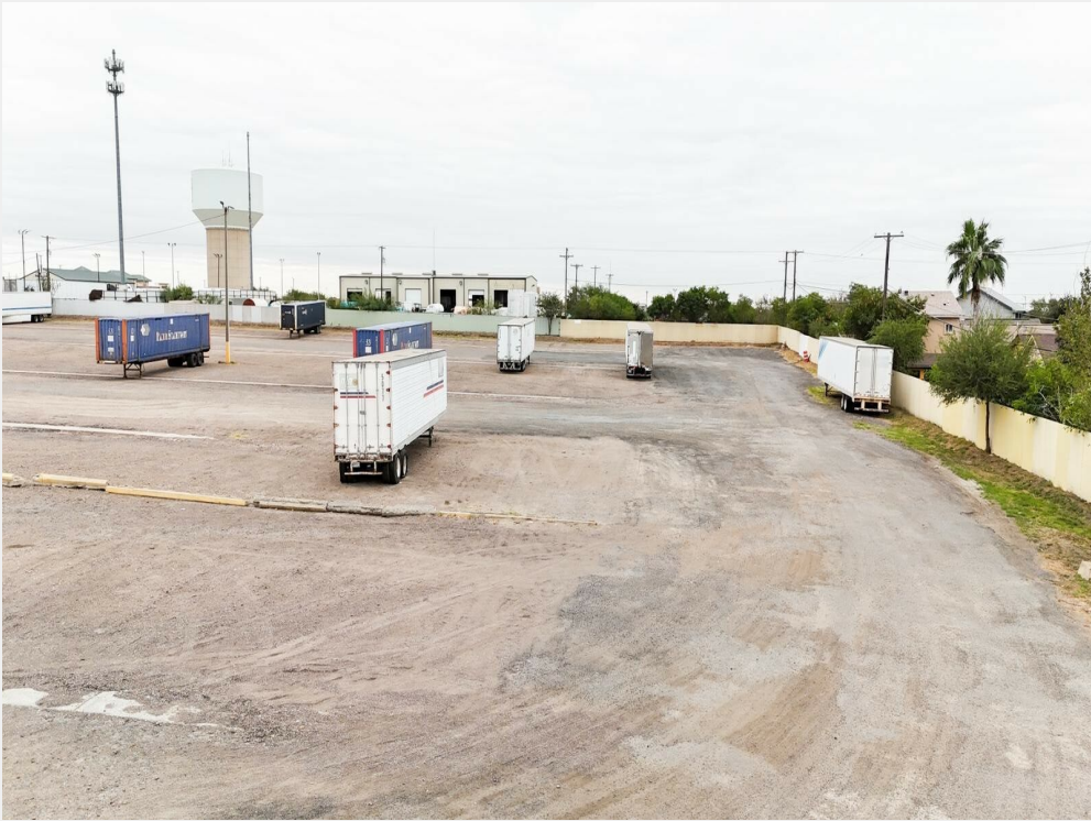
Available space drone view