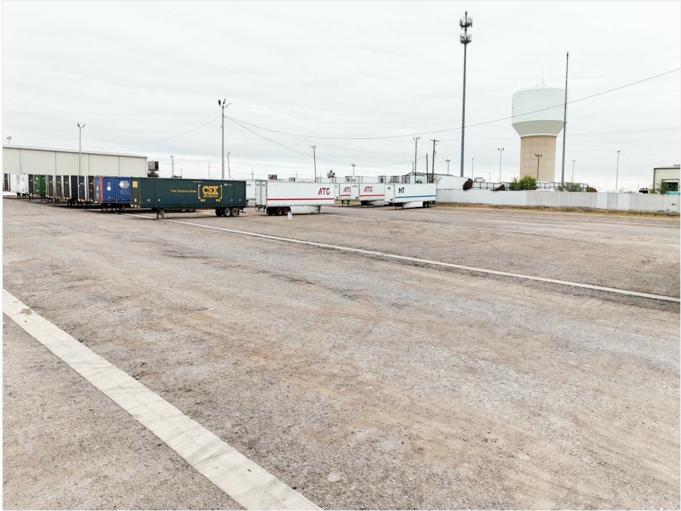
Available space ground view