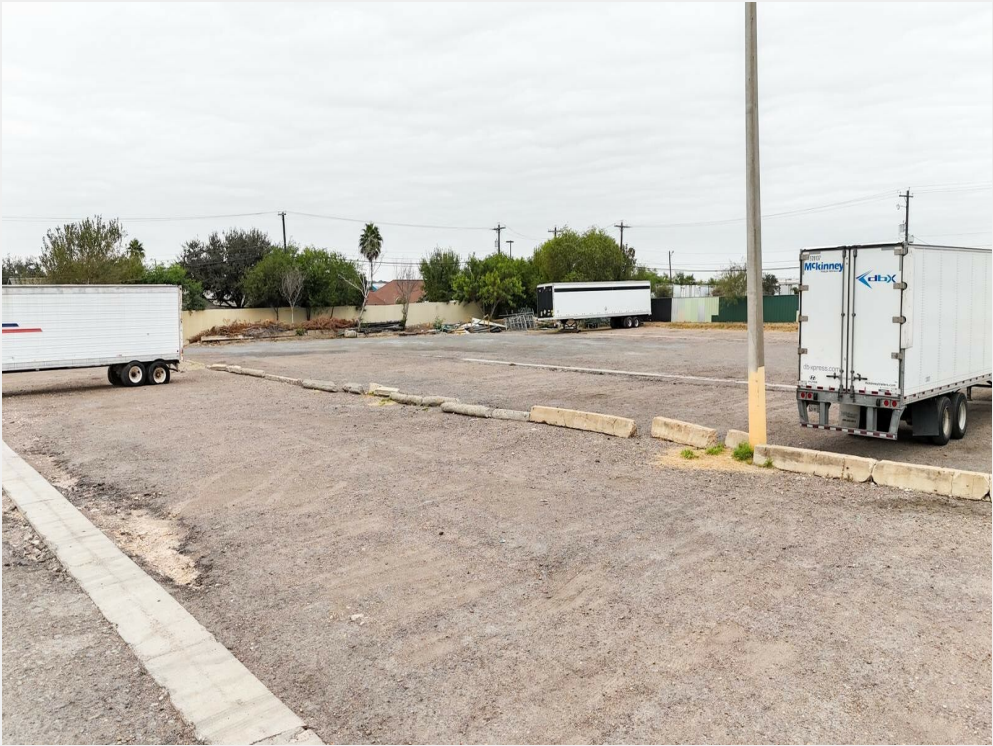
Available space ground view