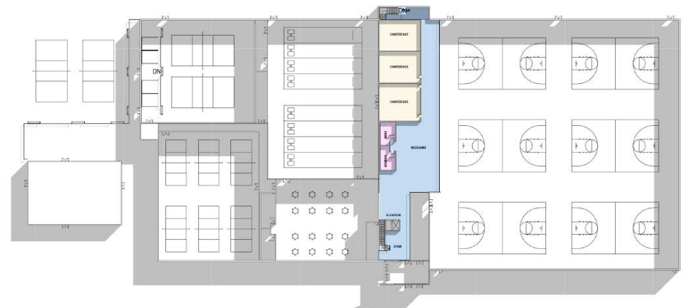
SECOND LEVEL FLOOR PLAN

Contact Listing Agents For More Information: