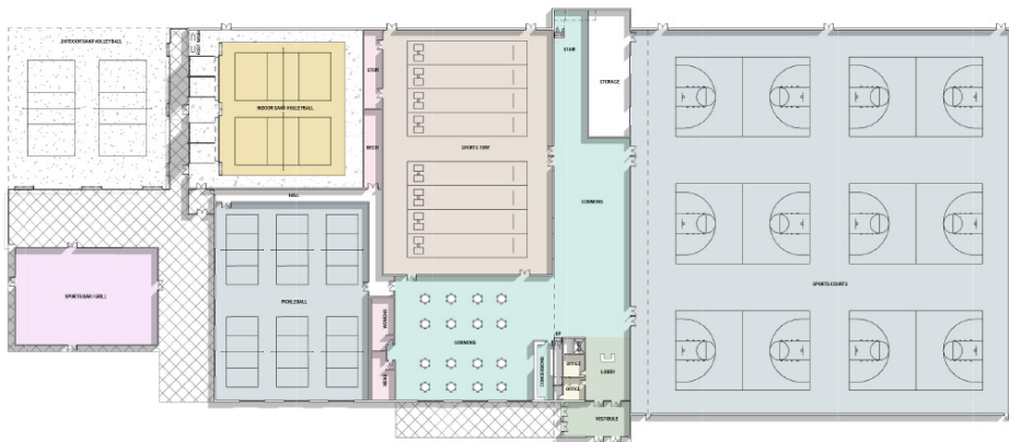
FIRST LEVEL FLOOR PLAN