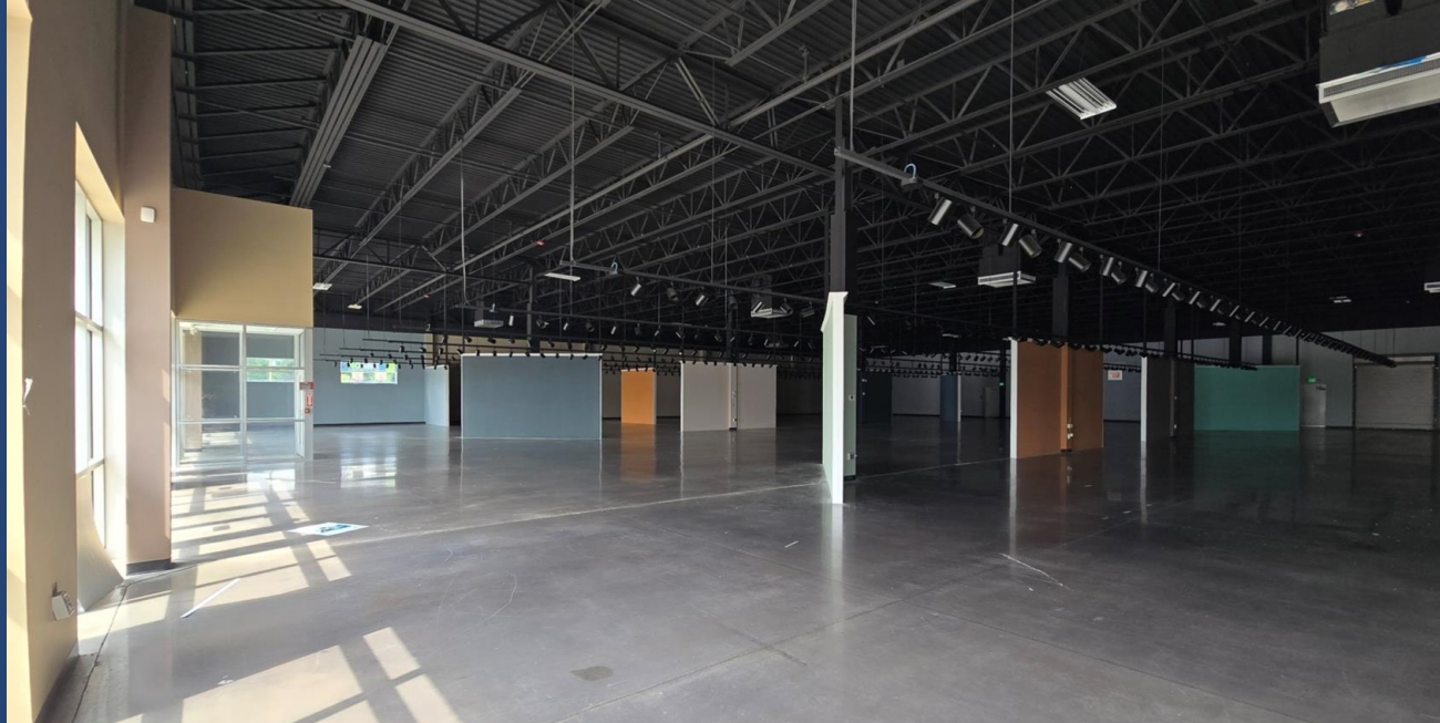
Ready for Build-Out