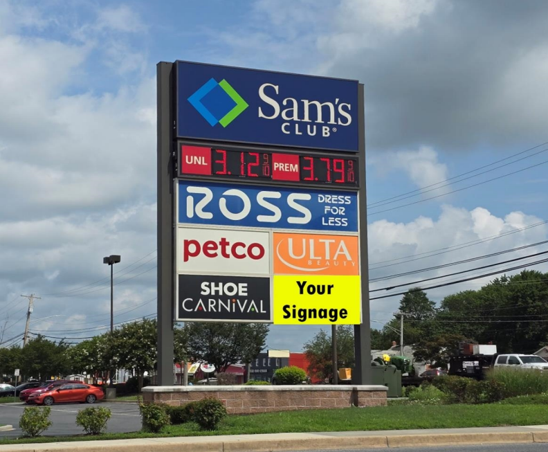
Signage at Center Entrance