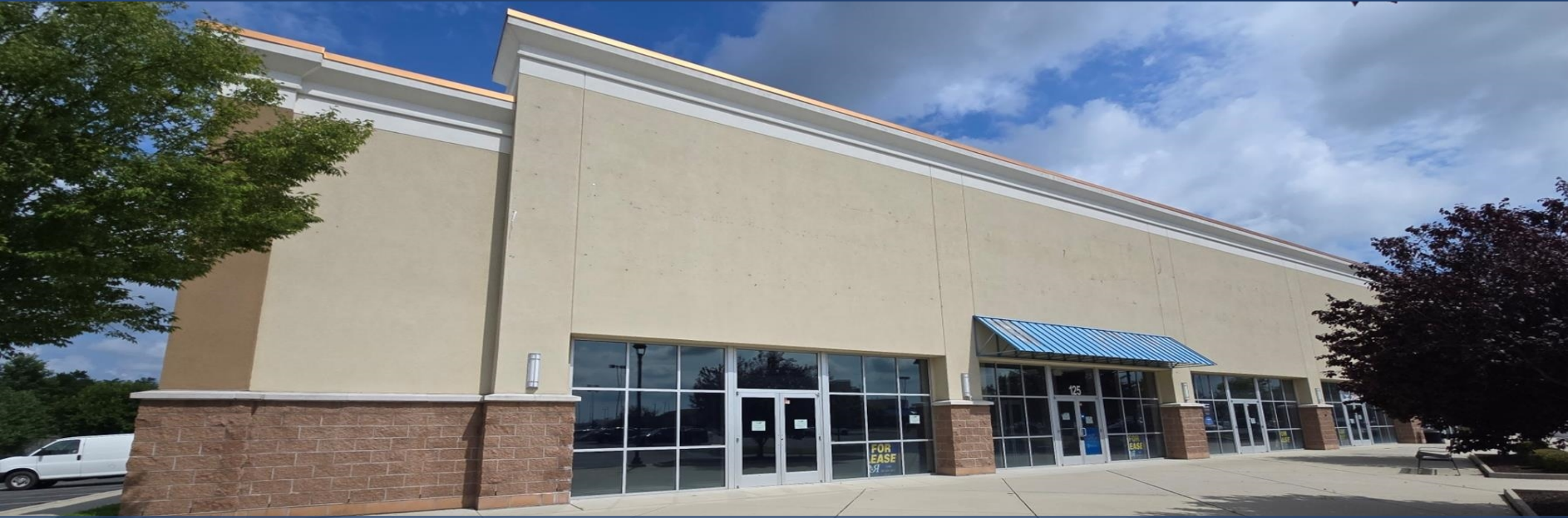
134' of Building Frontage