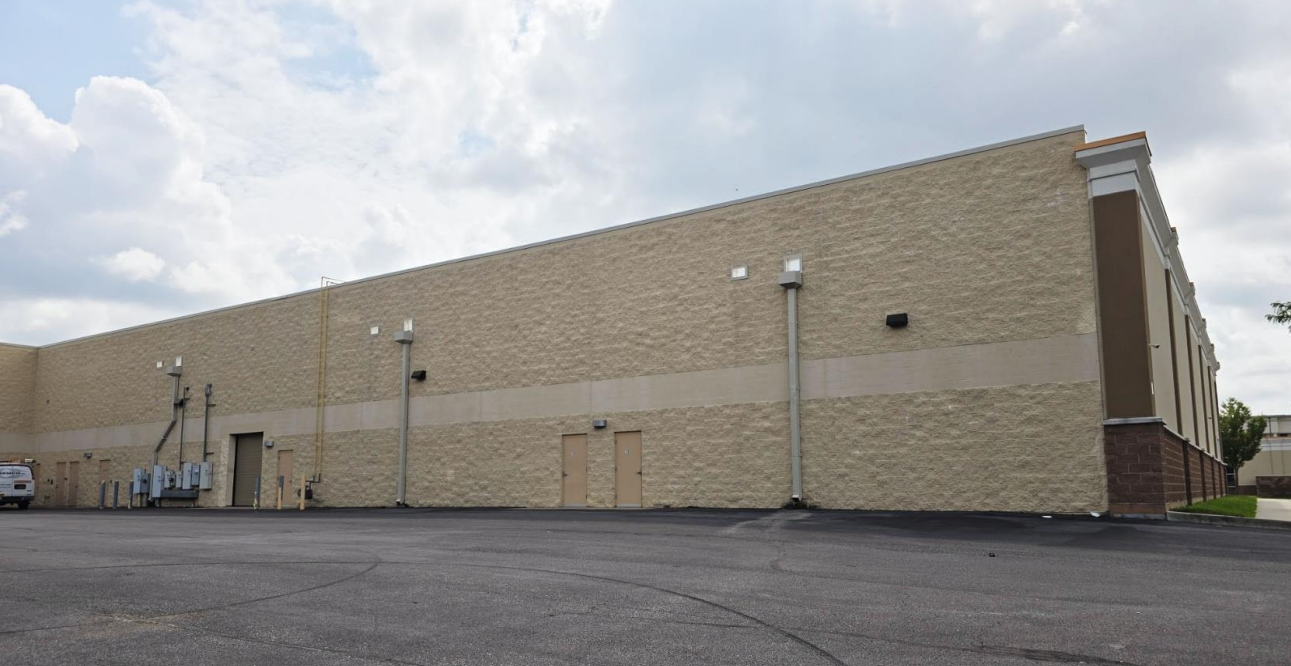
8'x10' Loading Door