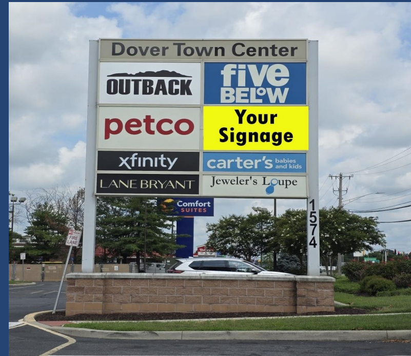
Signage along Rt 13