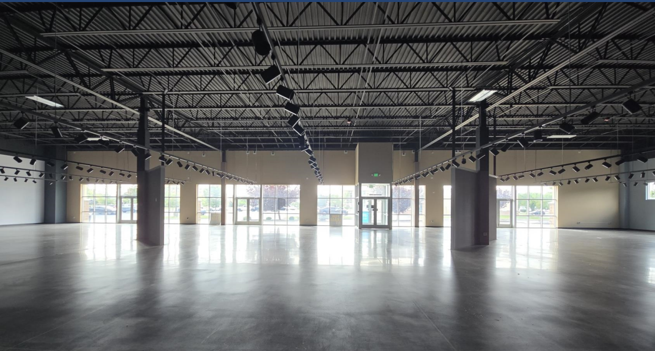
Wide Open Space