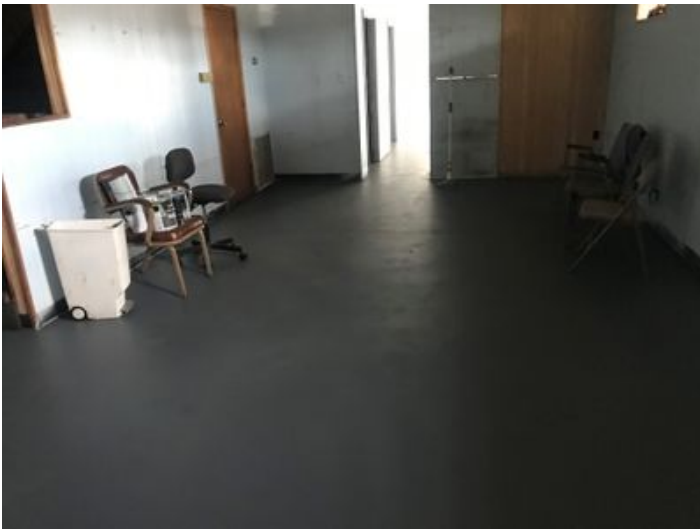
406 S. Royal office 2