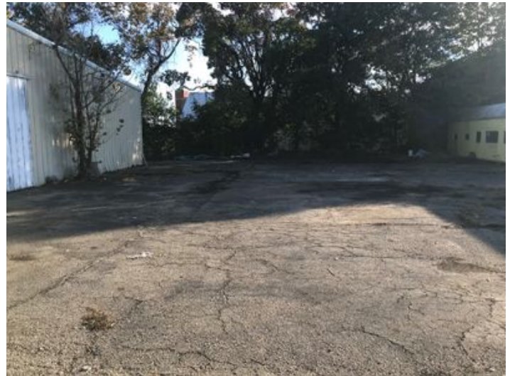
406 S. Royal St. back pic