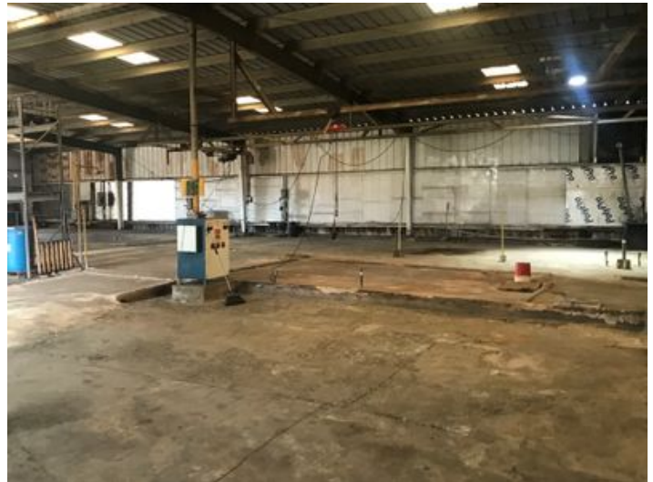
406 S. Royal whse