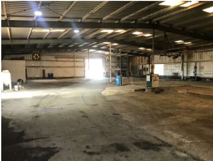
406 S. Royal whse pic 2