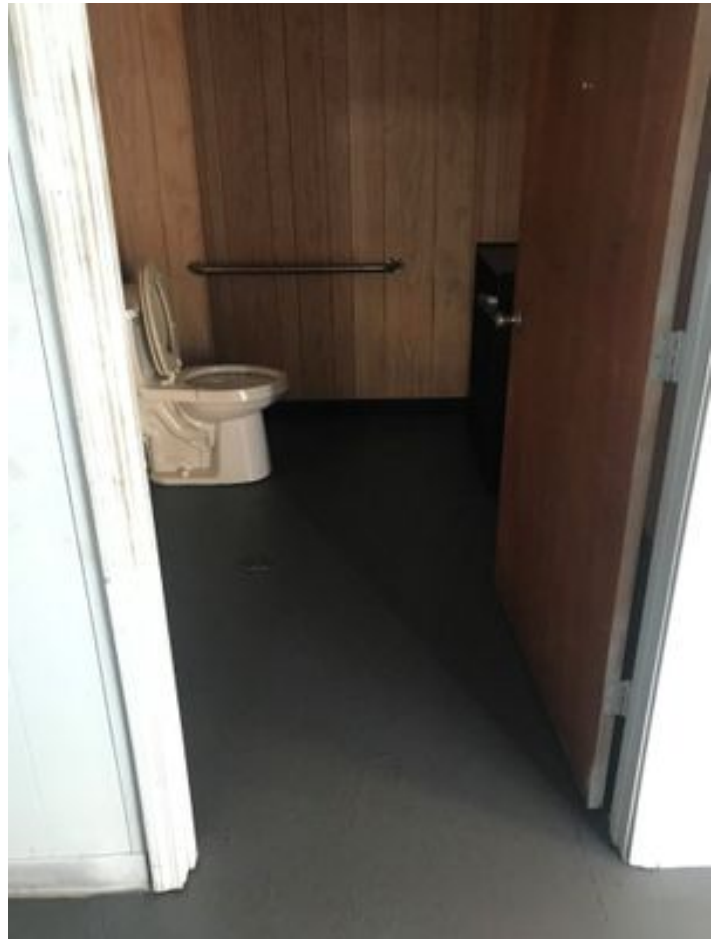
406 S. Royal RR