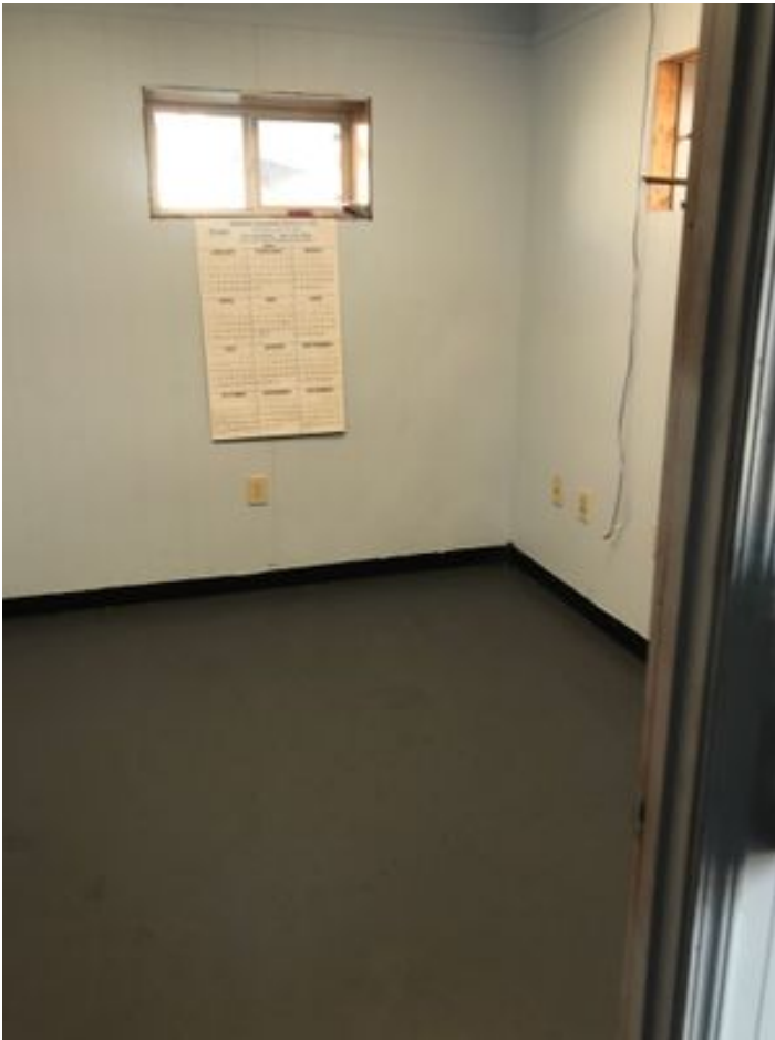
406 S. Royal office