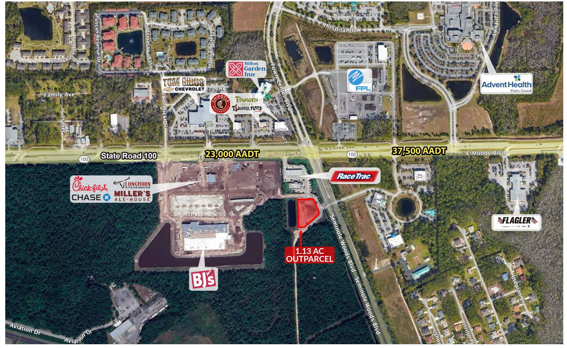
1.13 ACRE PAD READY PARCEL AVAILABLE | FOR LEASE STATE ROAD 100 & SEMINOLE WOODS BLVD | PALM COAST, FL

4735 Seminole Woods Blvd Palm Coast, FL 32164