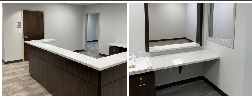
SAMPLE LANDLORD BUILT FINISHES

AVAILABLE: 10,000 SF TO BE BUILT ADJACENT