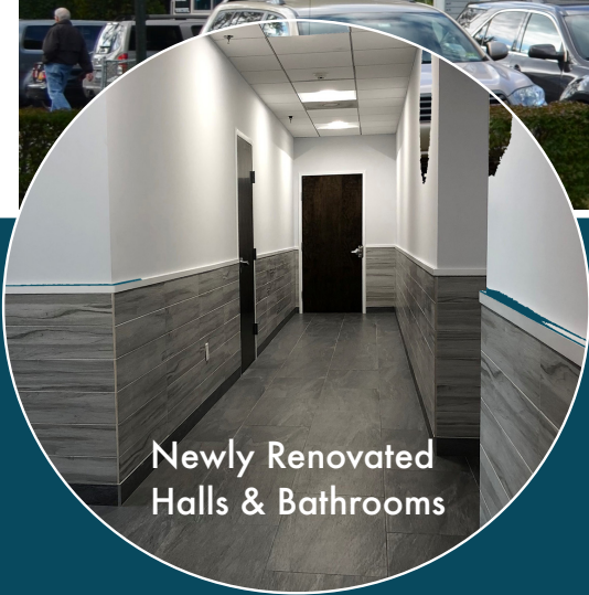
Newly Renovated Halls & Bathrooms