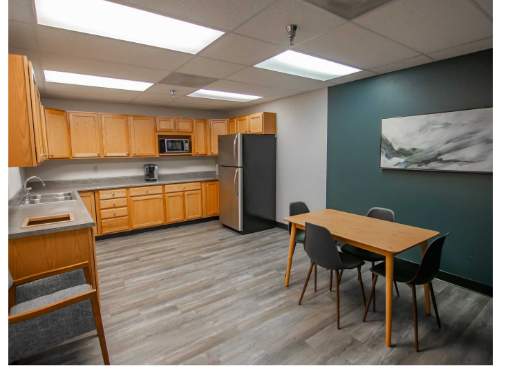
KW COMMERCIAL | BLACK HILLS 2401 W. Main Rapid City, SD 57702