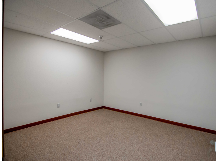
KW COMMERCIAL | BLACK HILLS 2401 W. Main Rapid City, SD 57702