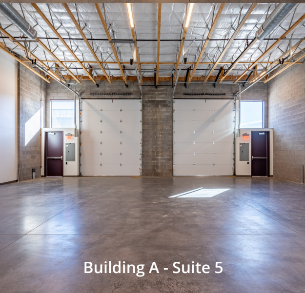
Building A - Suite 5