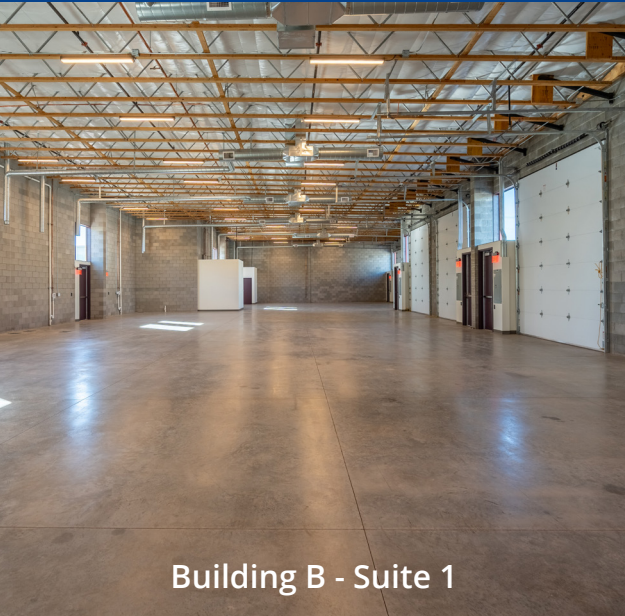
Building B - Suite 1

Two building development in a premiere downtown location with \pm 21,000 SF total of industrial space situated on a \pm 34,750 SF lot.