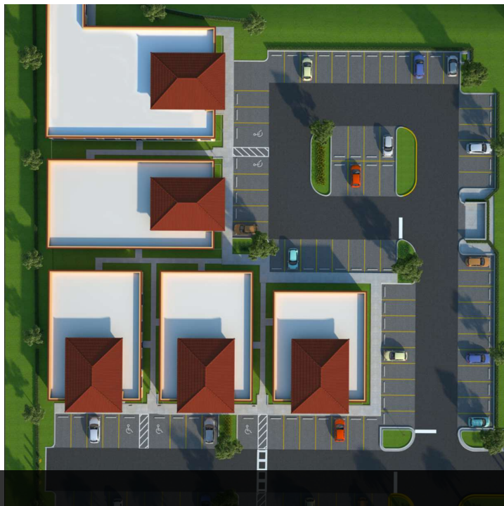
Renderings of Buildings