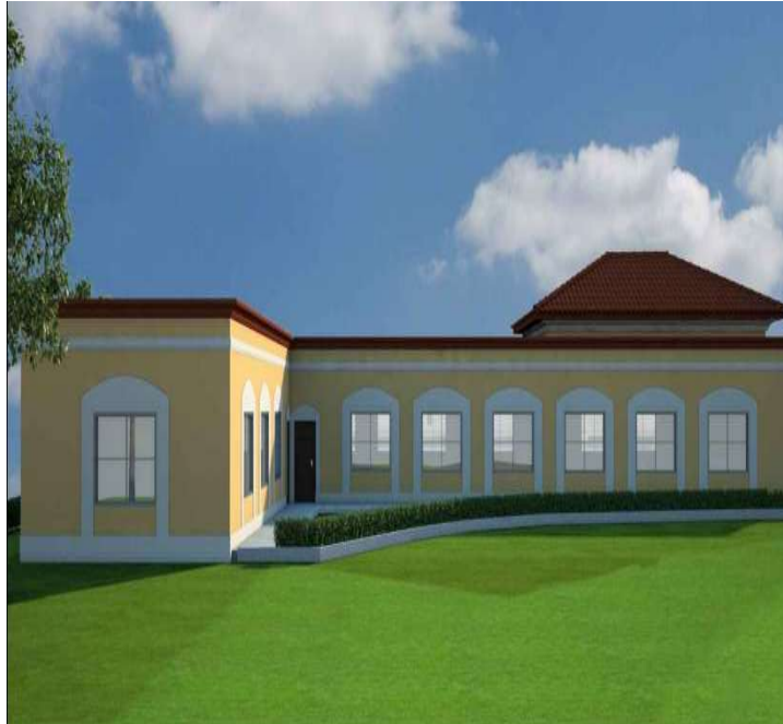
North Elevation Rendering