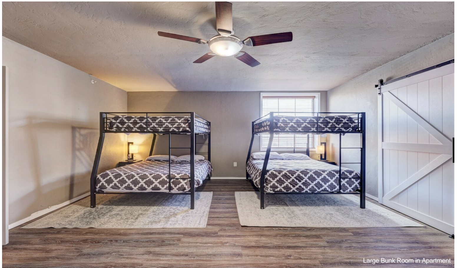
Large Bunk Room in Apartment