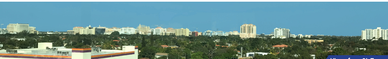
Views from GL Tower