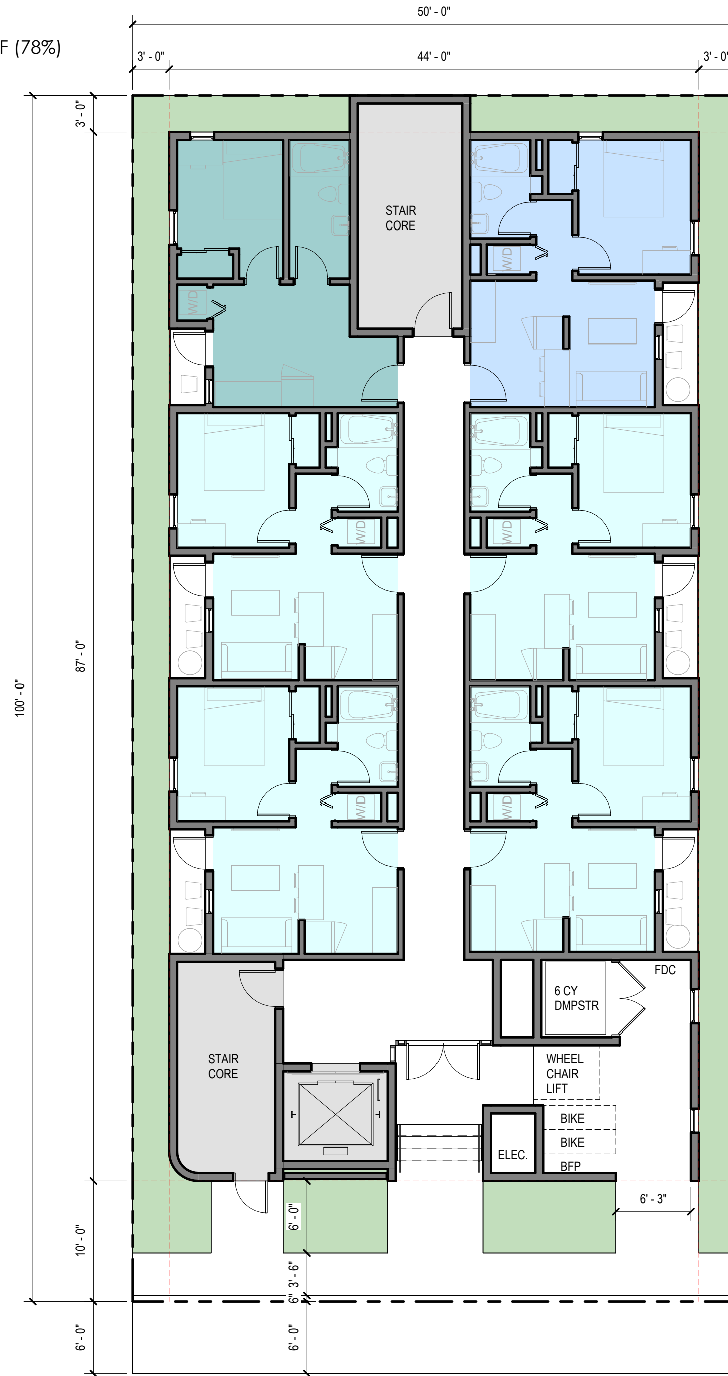
1 LEVEL 1 1/8" = 1'-0" 6 UNITS

PROJECT ADDRESS: 667 NW 1st St, Miami, FL 33128