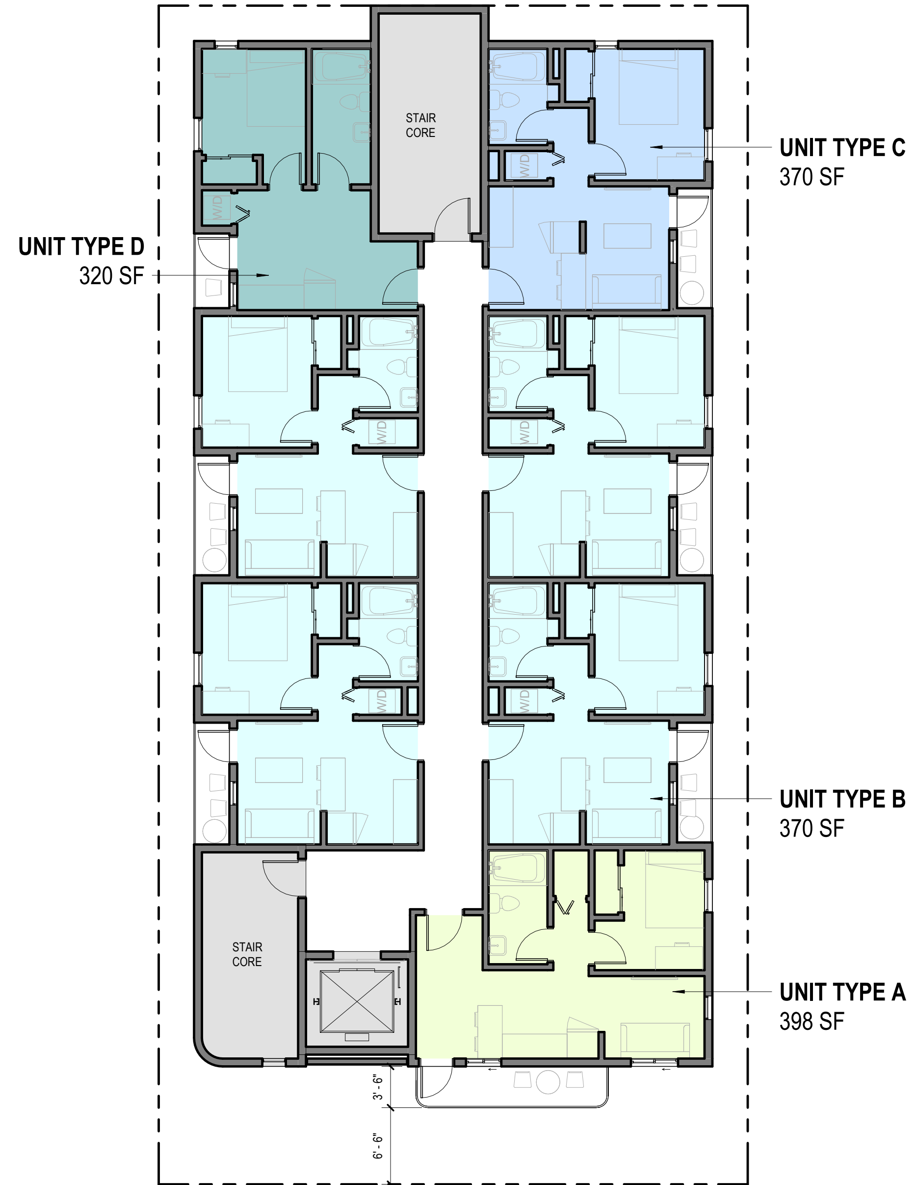
2 LEVELS 2-5 1/8" = 1'-0" 7 UNITS EACH FLOOR