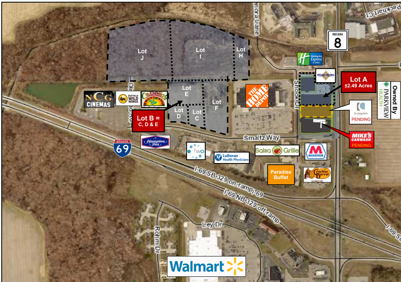
Sample Site Plan