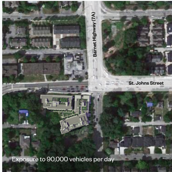
High Exposure Location