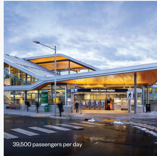
Access to Rapid Transit