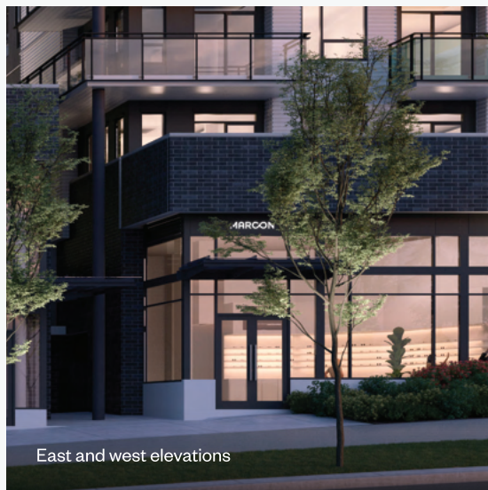
Prominent Signage Opportunities