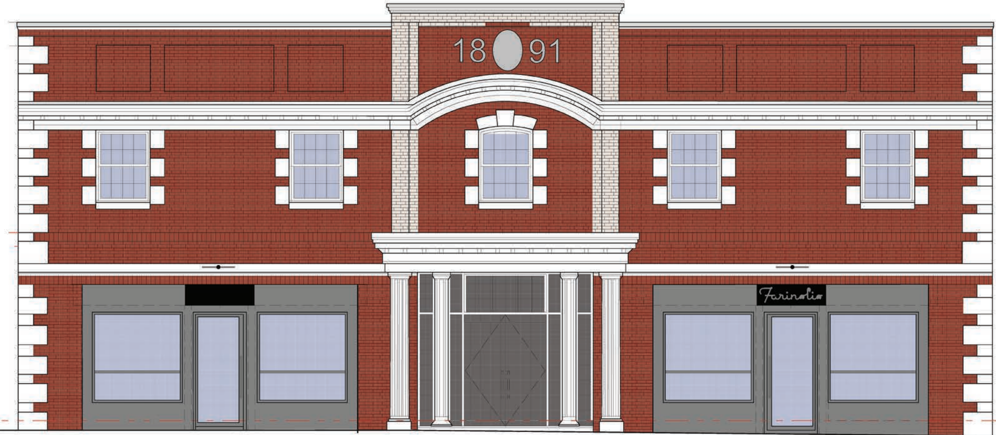
12 BANK STREET - FRONT ELEVATION