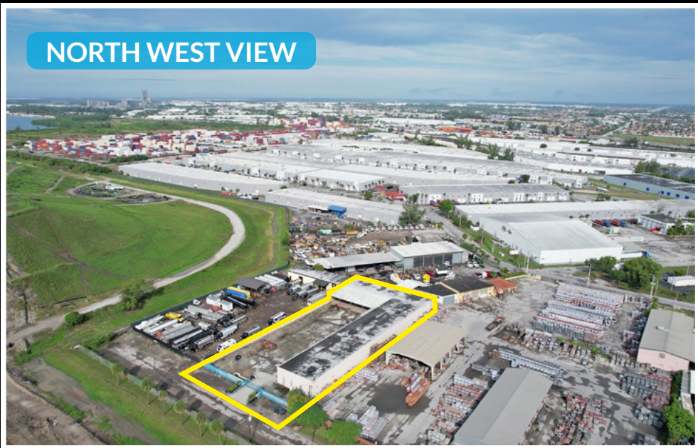
NORTH WEST VIEW