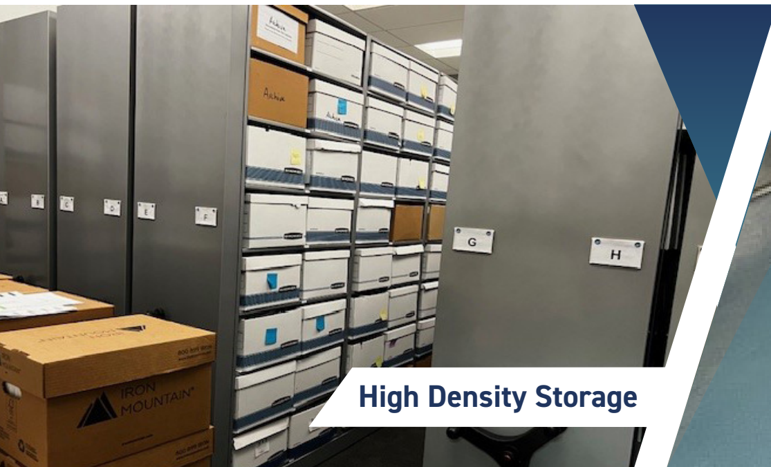
High Density Storage