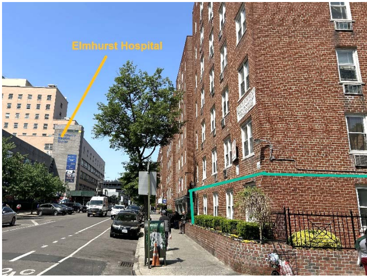
Across the Street from Elmhurst Hospital