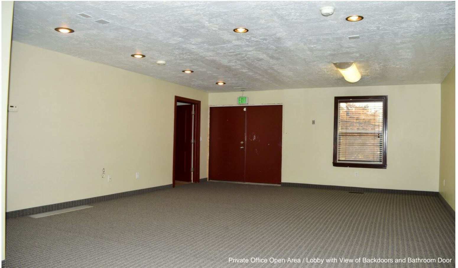
Private Office Open Area / Lobby with View of Backdoors and Bathroom Door