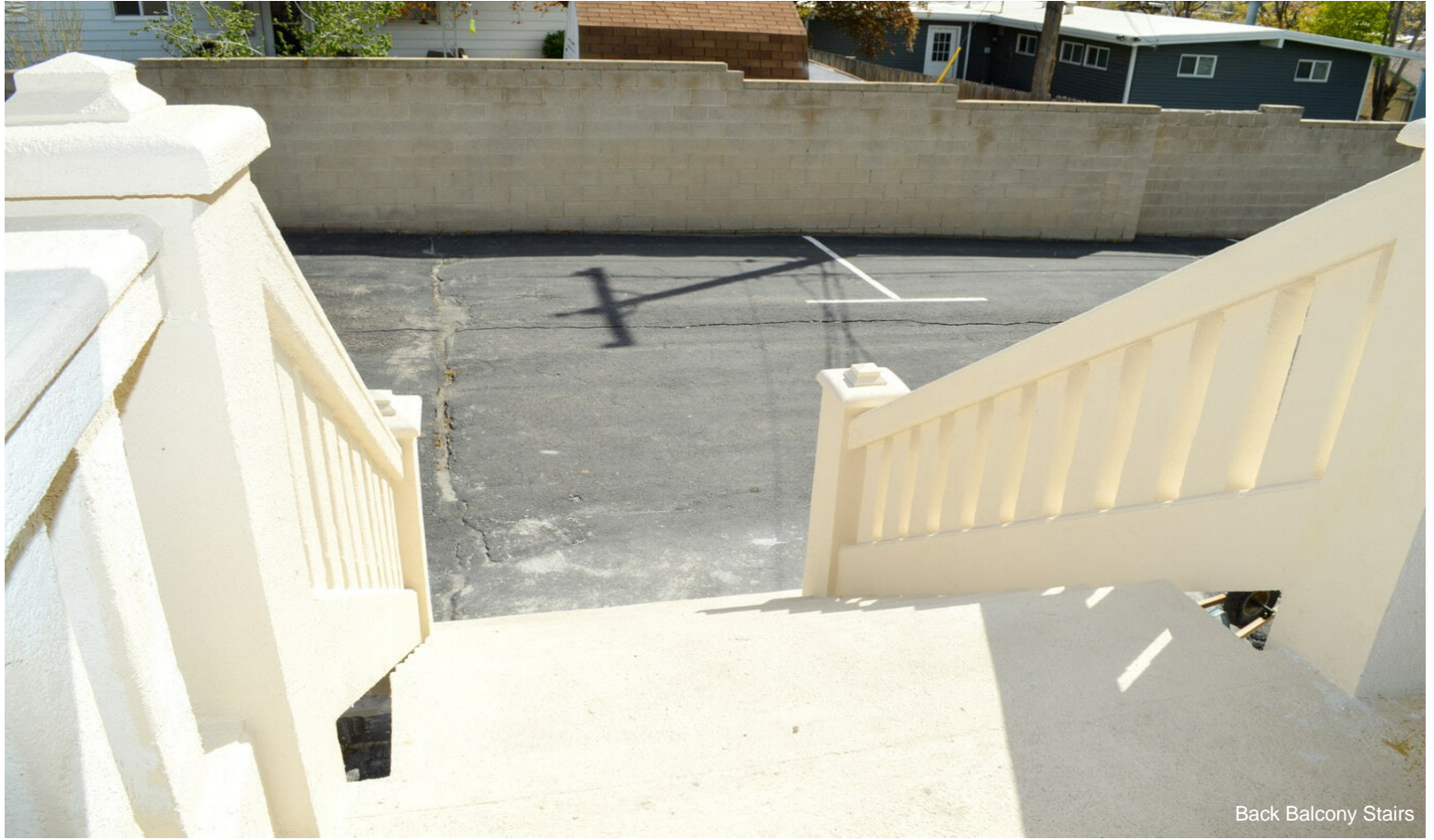
Back Balcony Stairs