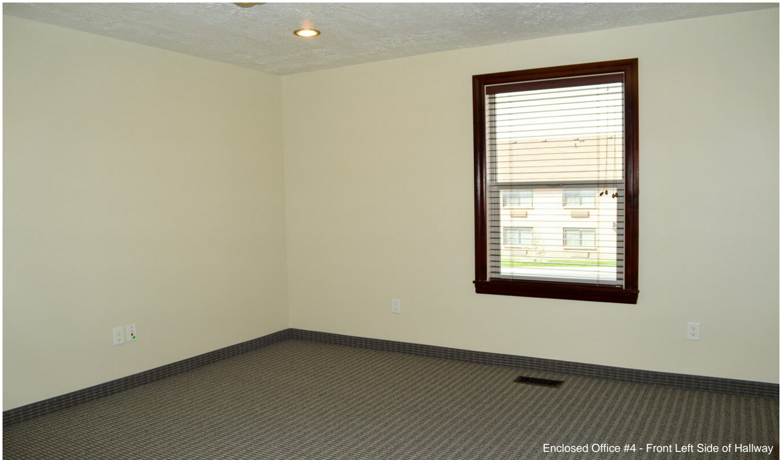
Enclosed Office #4 - Front Left Side of Hallway