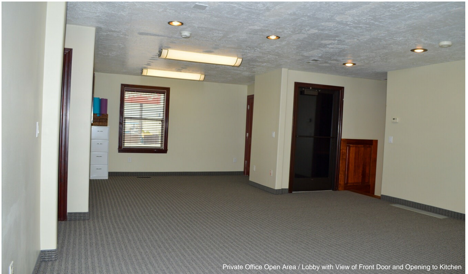
Private Office Open Area / Lobby with View of Front Door and Opening to Kitchen