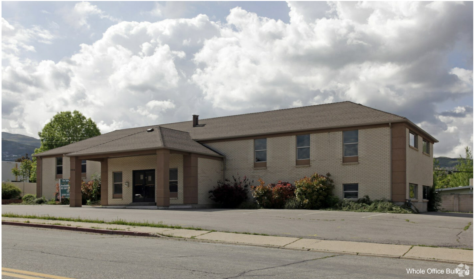
Whole Office Building