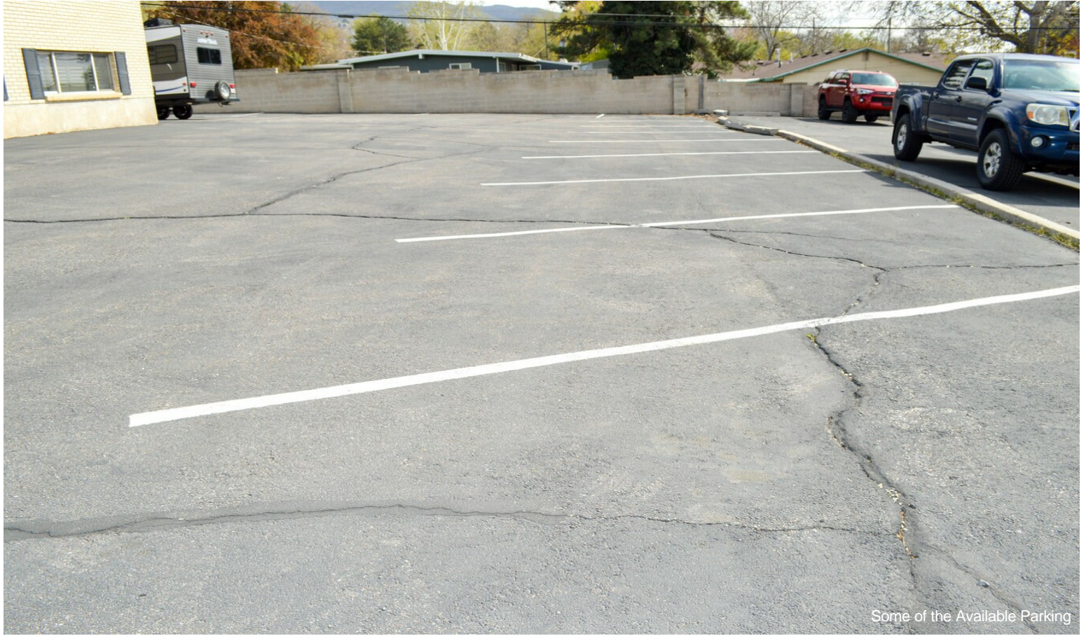
Some of the Available Parking