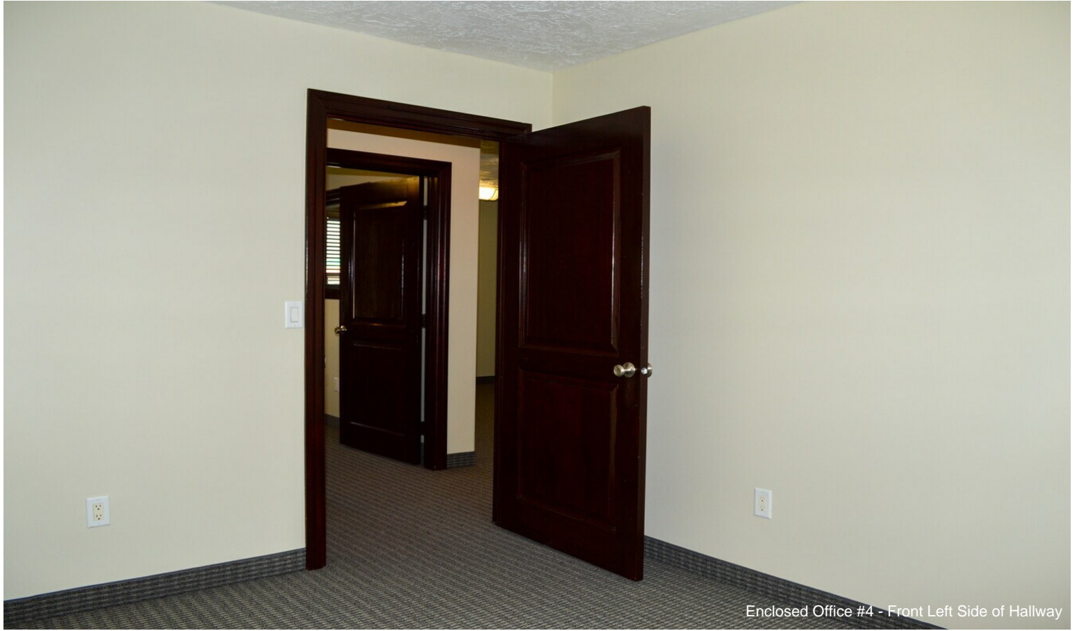
Enclosed Office #4 - Front Left Side of Hallway