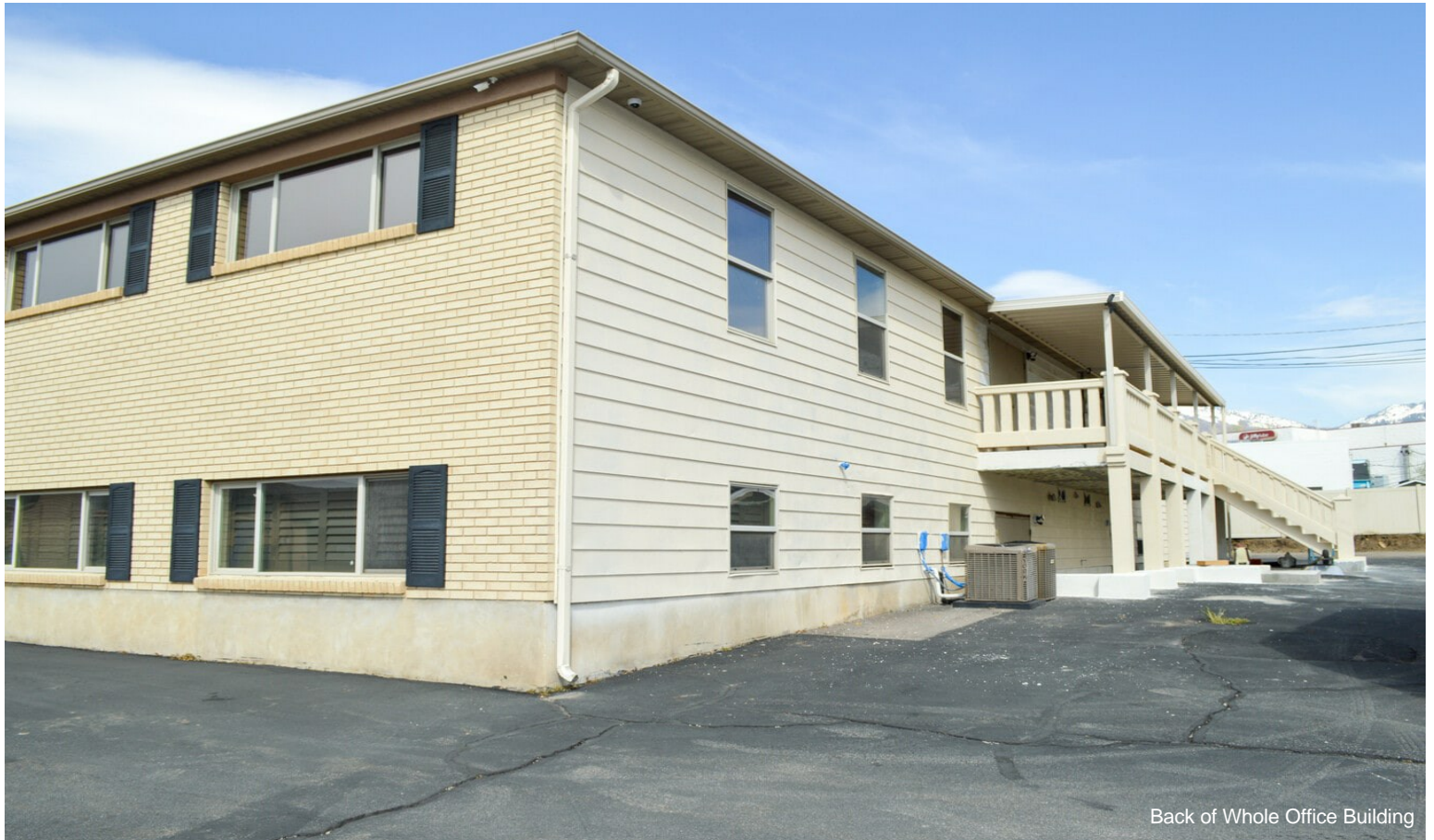
Back of Whole Office Building