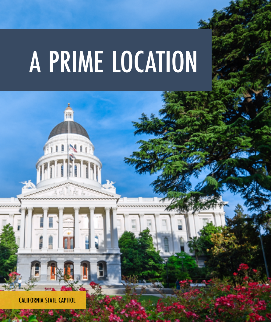
CALIFORNIA STATE CAPITOL