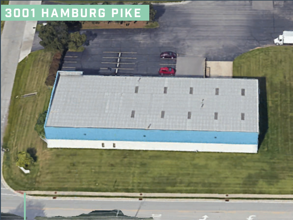
3001 HAMBURG PIKE