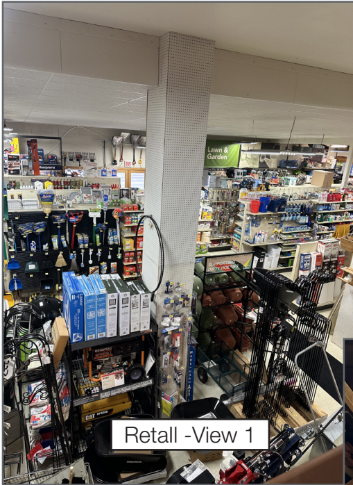
Retail -View 1