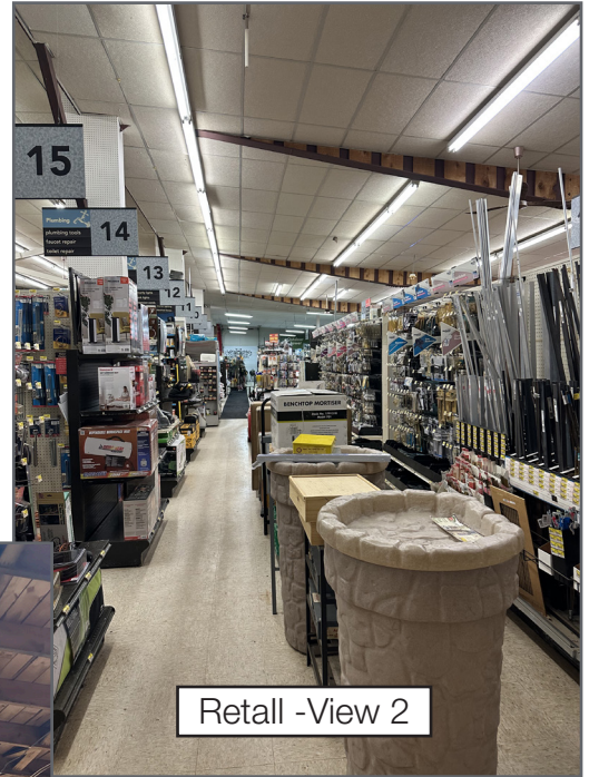
Retail -View 2