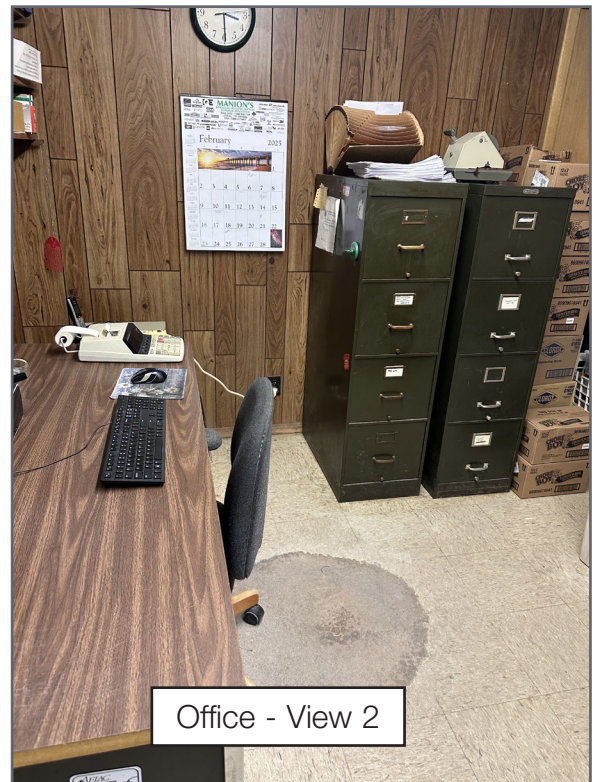
Office - View 2