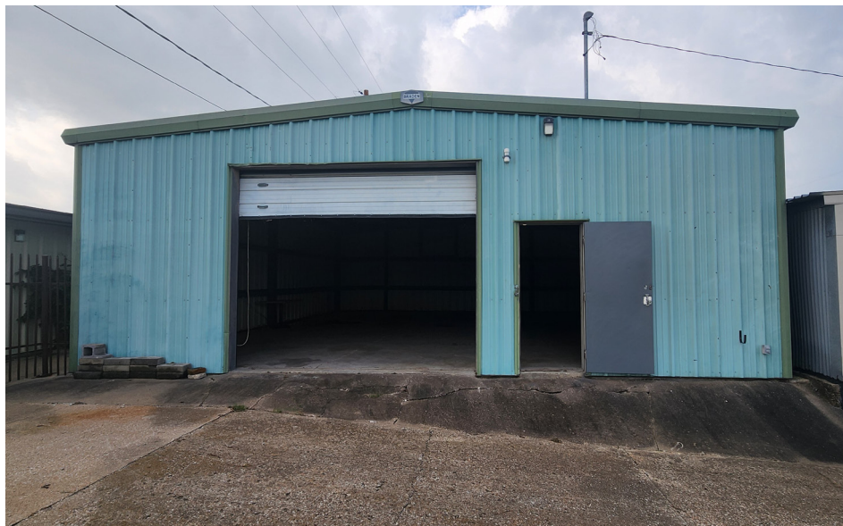
Small Warehouse Building