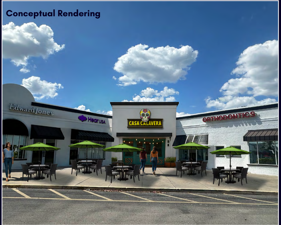
Unit 103 & 105