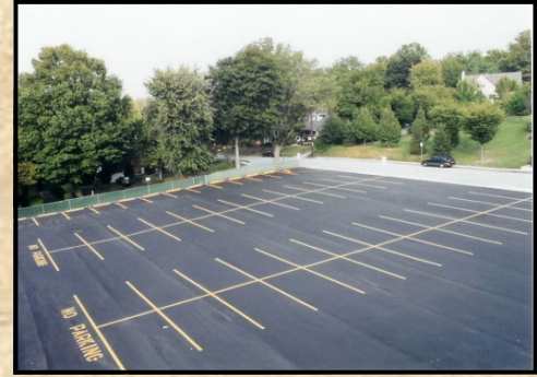
Rear Parking Lot