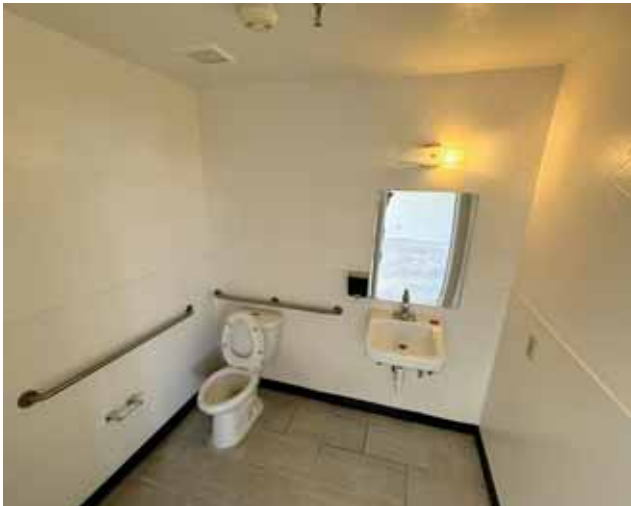
3093 McKee Road - ADA Restroom