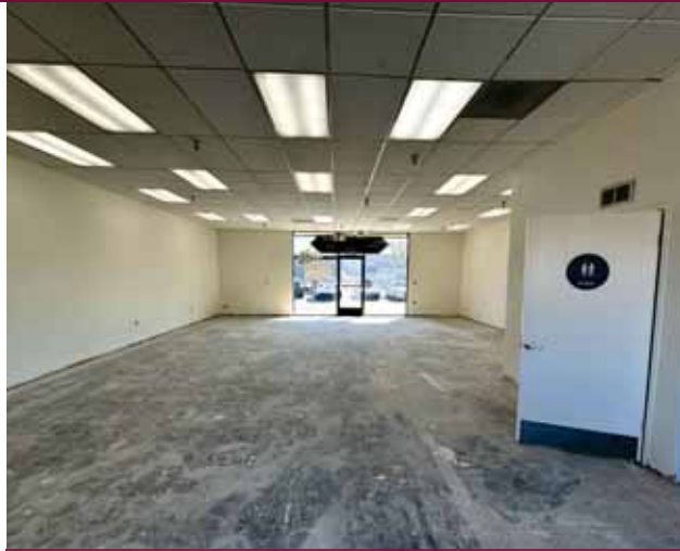
3093 McKee Road - Interior