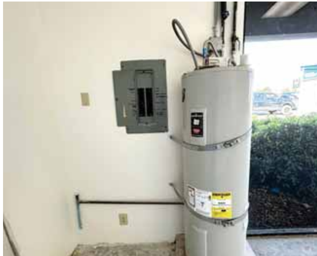
Electrical Panel & 40-Gallon Electric Hot Water Heater