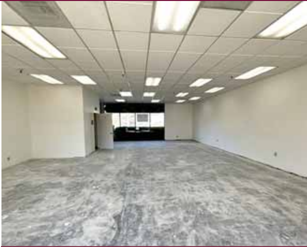
3093 McKee Road - Interior