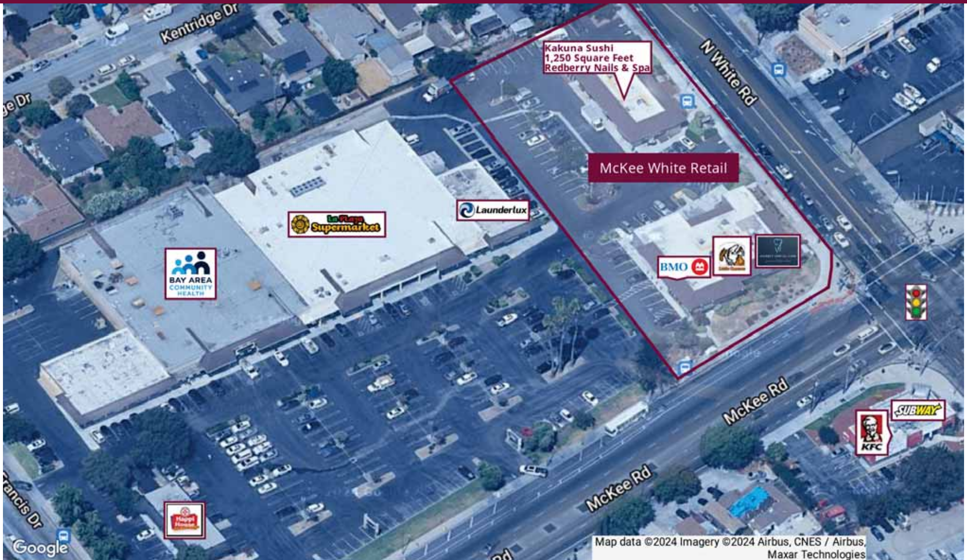
Map data ©2024 Imagery ©2024 Airbus, CNES / Airbus, Maxar Technologies