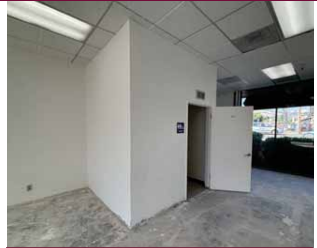
3093 McKee Road - Interior