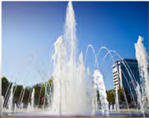
TOWN CENTER COMMONS (WATER FEATURES)