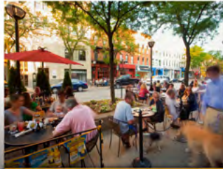
TOWN CENTER COMMONS (STREET LIFE)