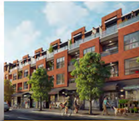
TOWN CENTER COMMONS (URBAN FEEL)