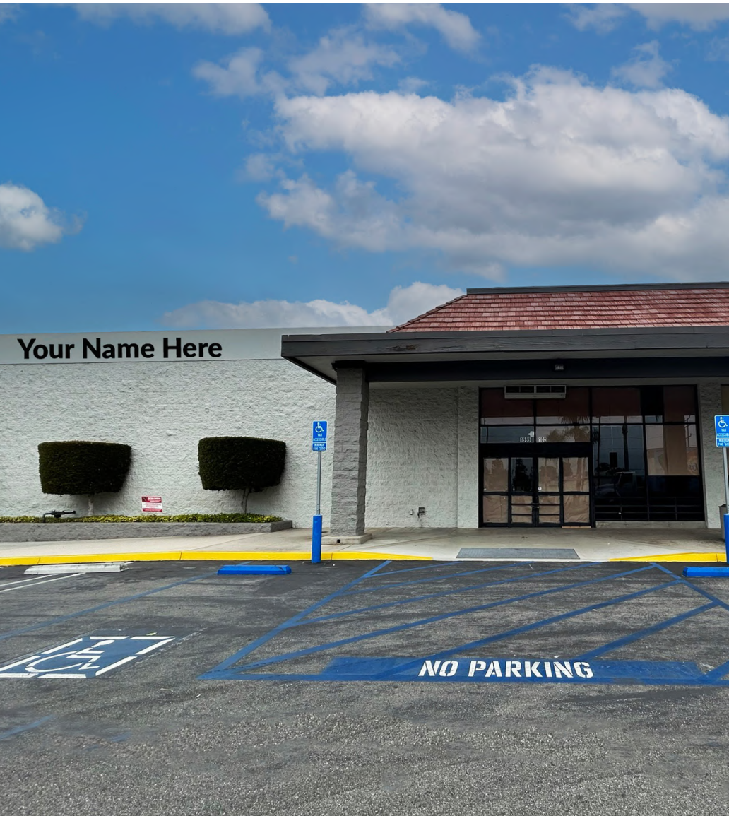
±11,469 SF available for lease located at 1999 River Rd. # 102 Norco, CA