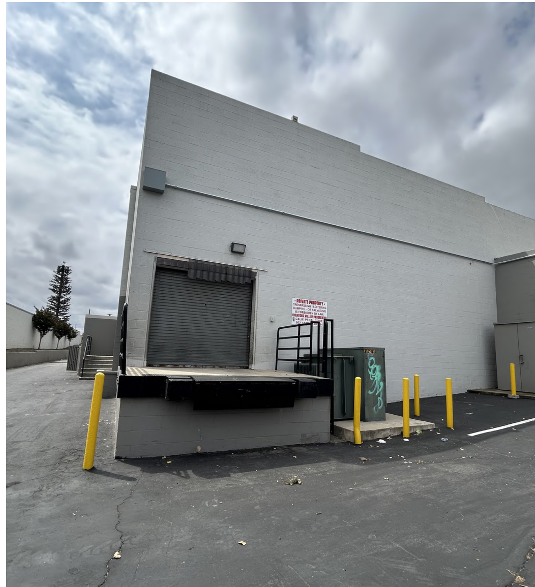
Loading Dock Available