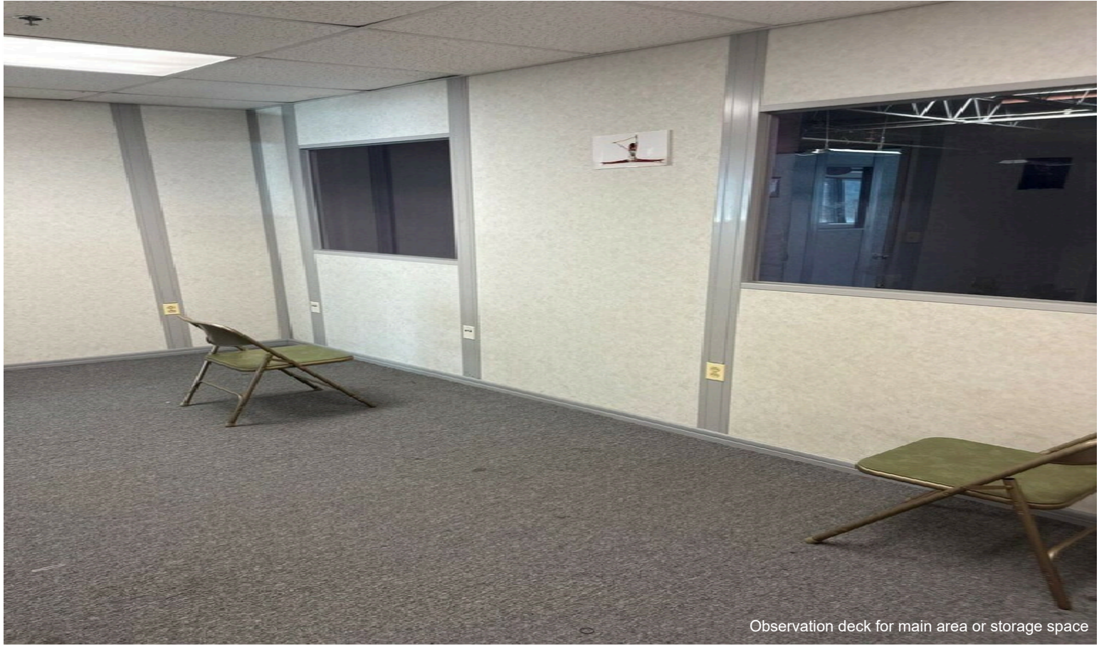
Observation deck for main area or storage space