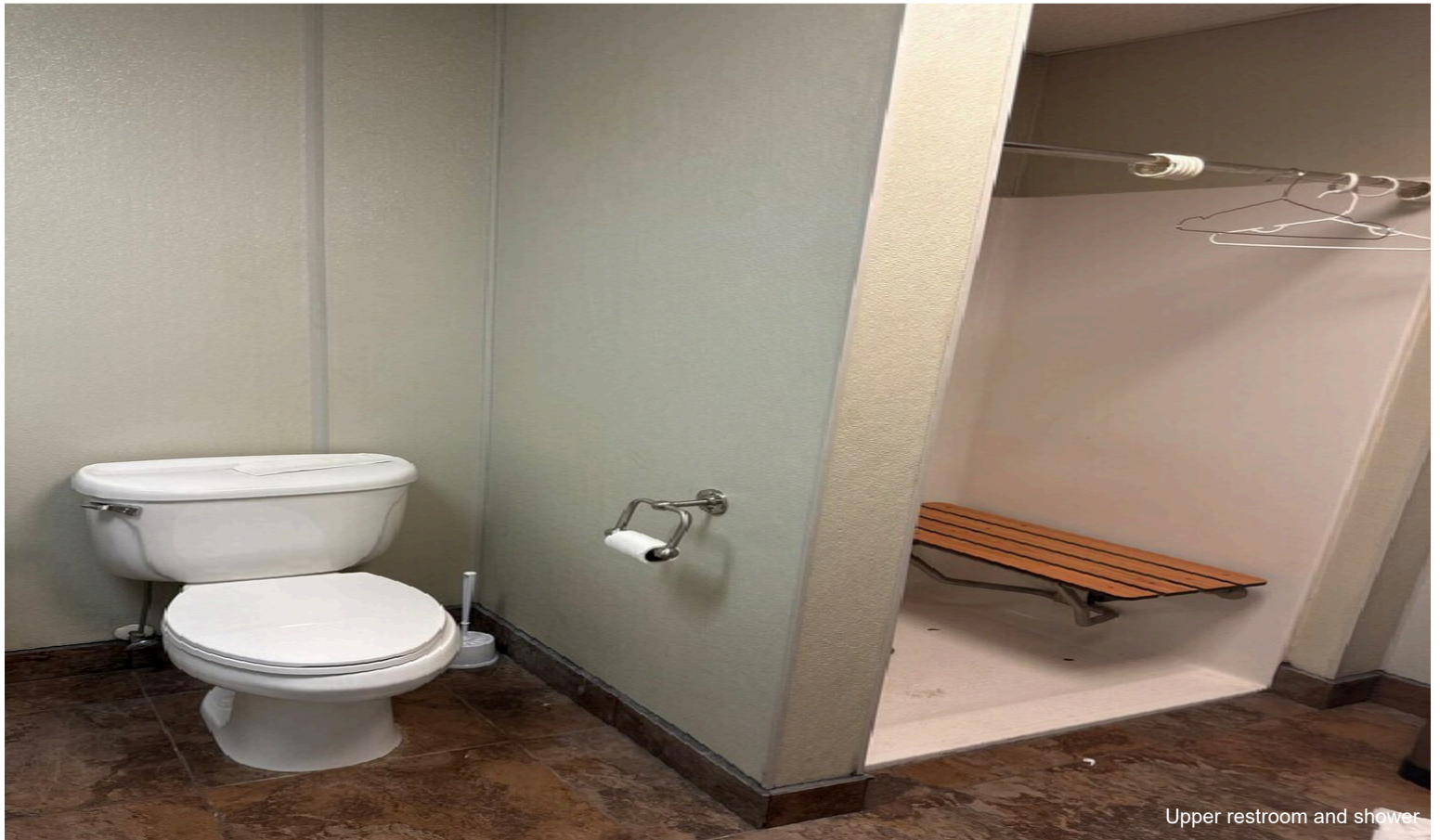
Upper restroom and shower