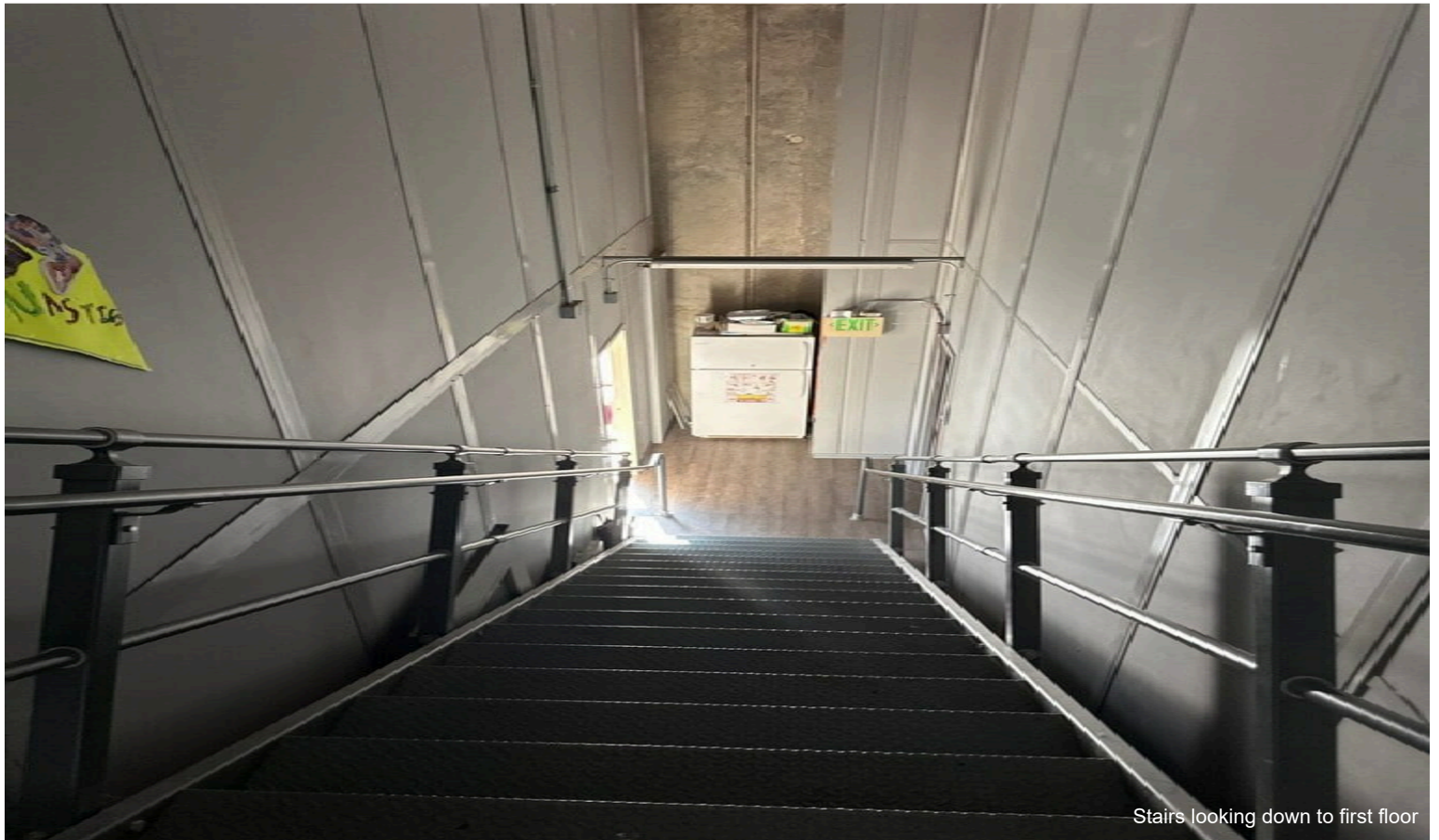
Stairs looking down to first floor