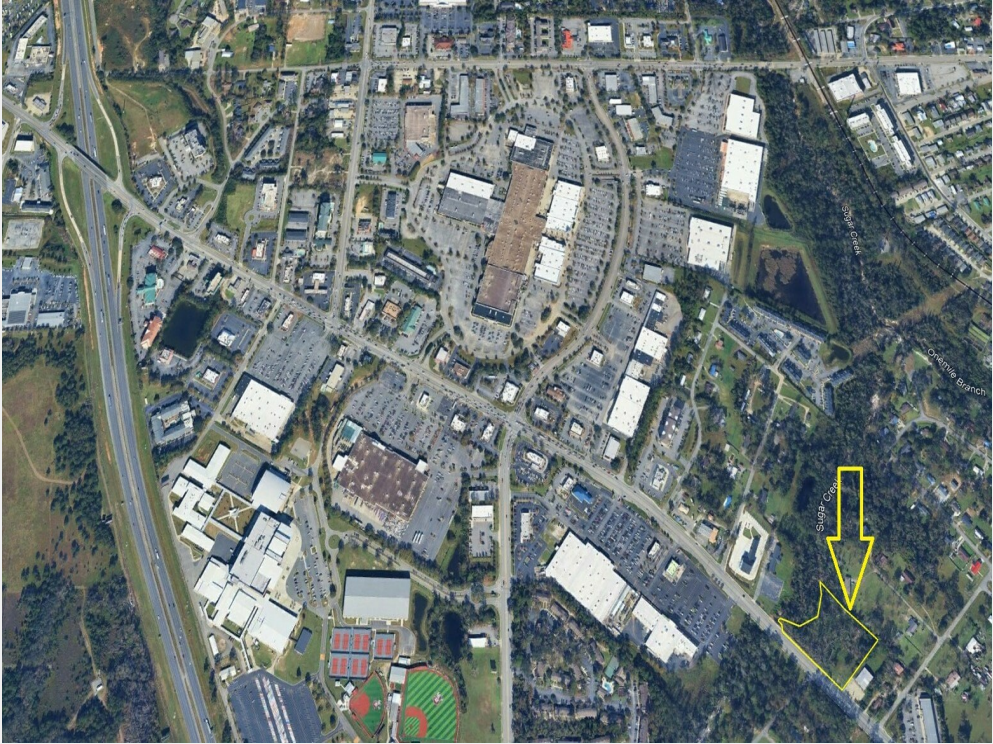
GE Aerial 2