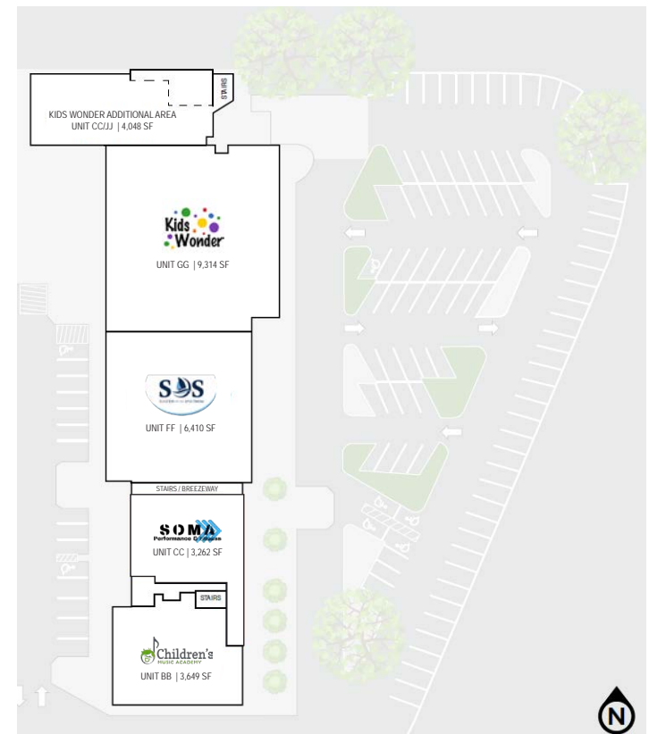
LEASE PLAN - LOWER LEVEL