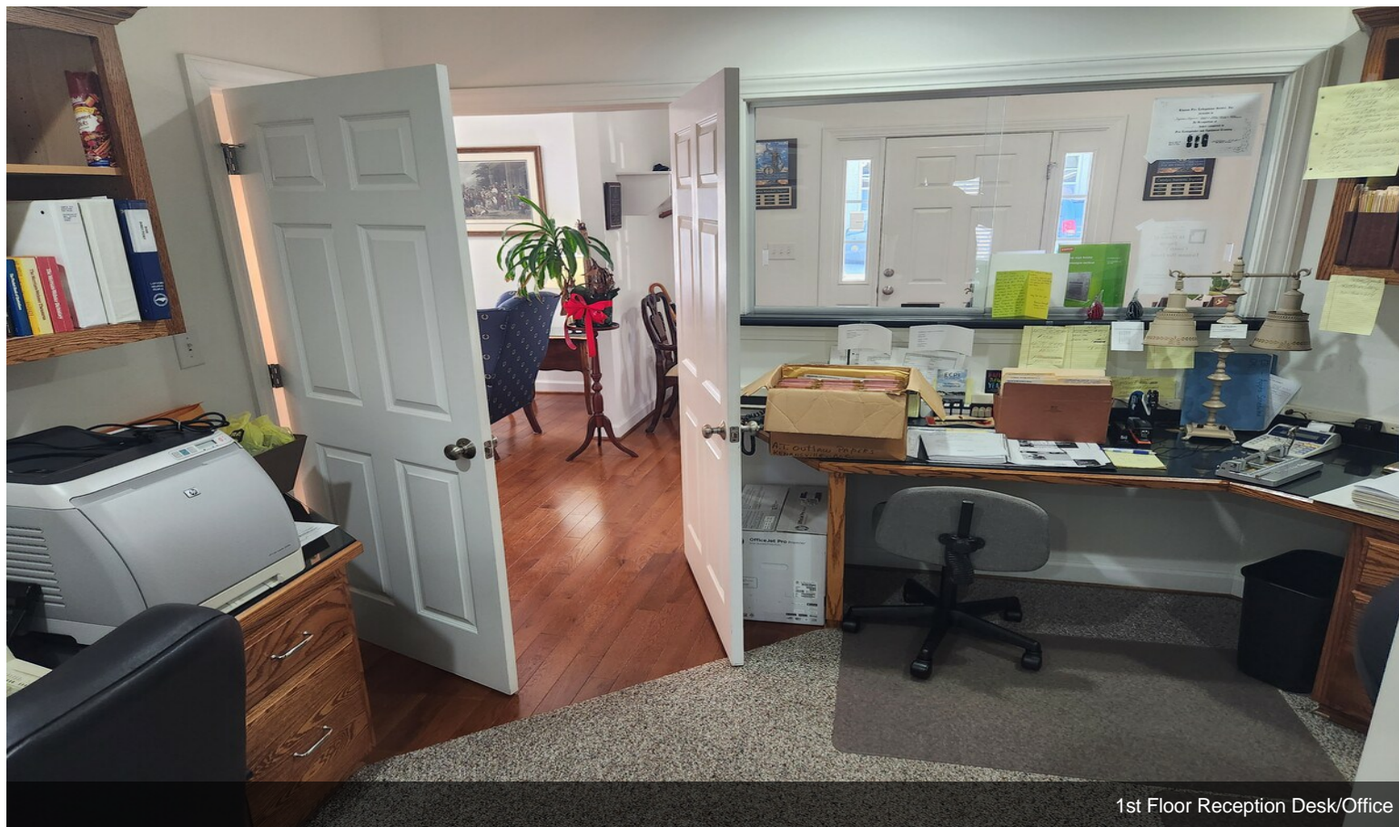
1st Floor Reception Desk/Office