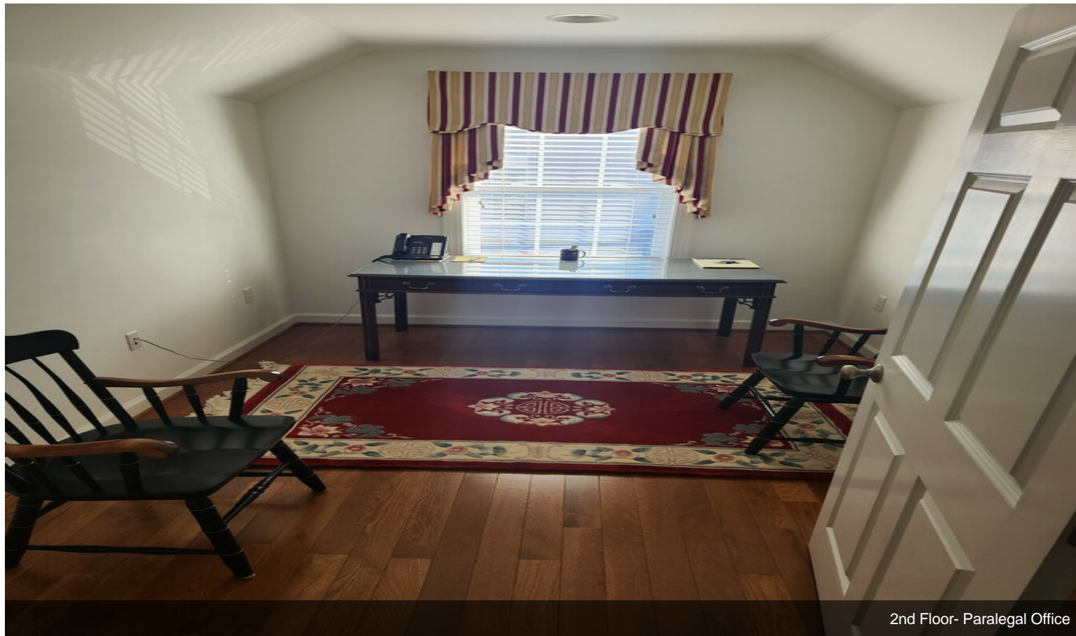
2nd Floor- Paralegal Office