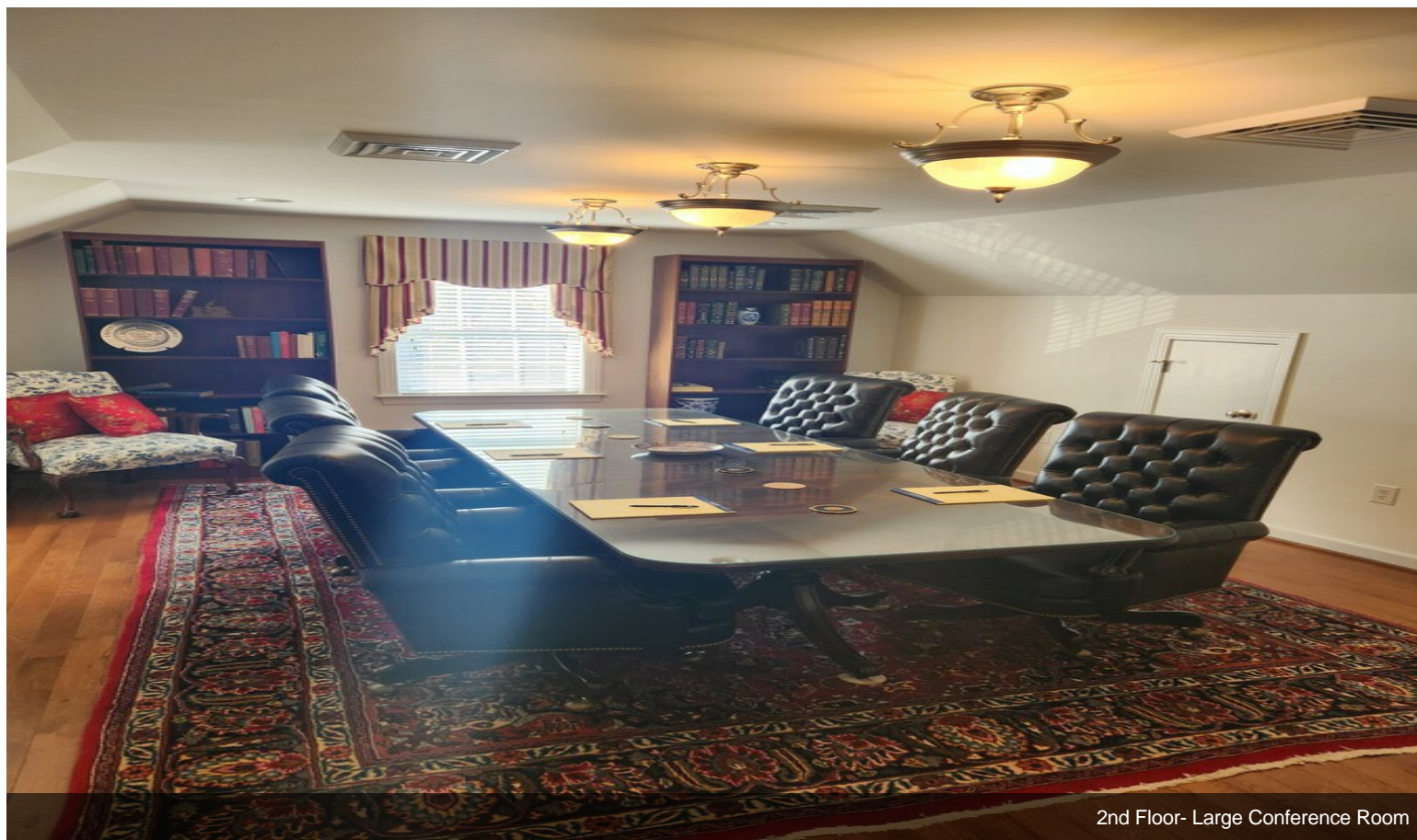
2nd Floor- Large Conference Room