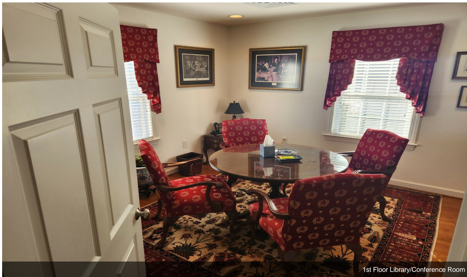
1st Floor Library/Conference Room