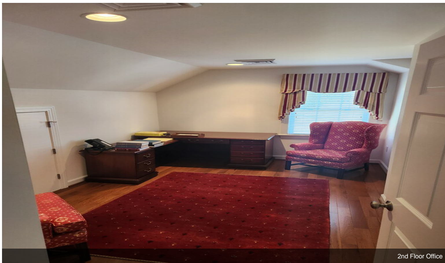
2nd Floor Office