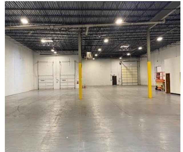
WAREHOUSE & OFFICE AREAS