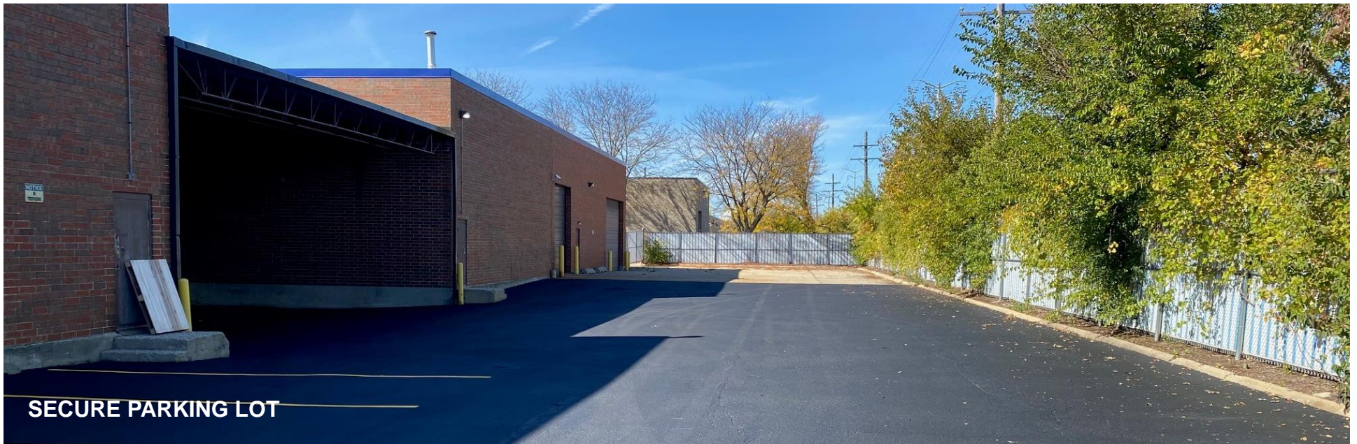
SECURE PARKING LOT