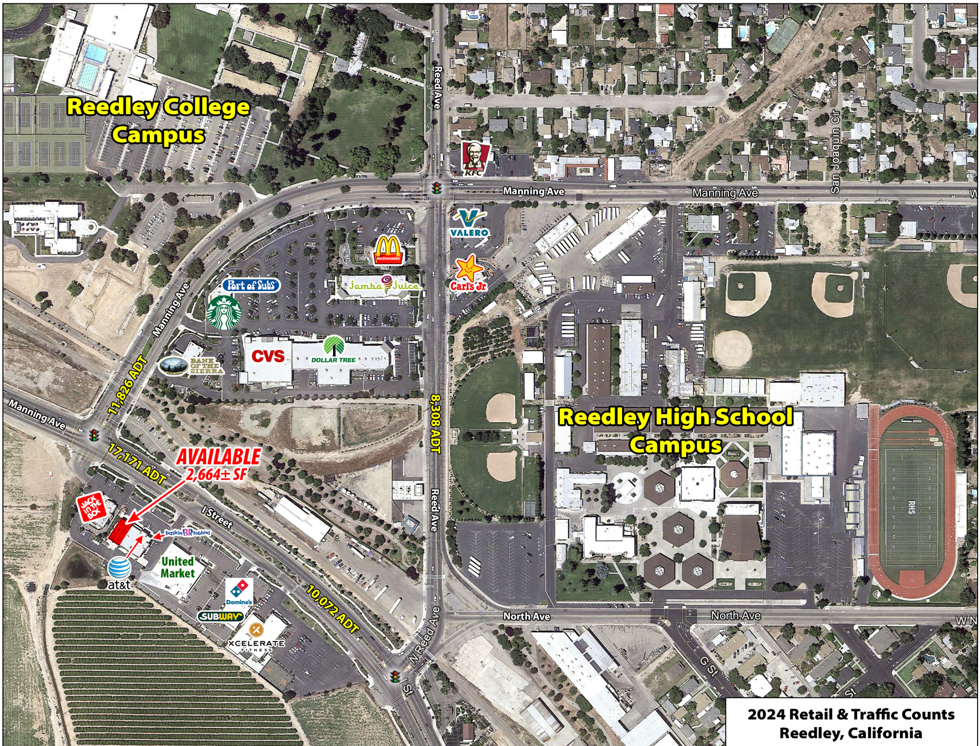
2024 Retail & Traffic Counts Reedley, California