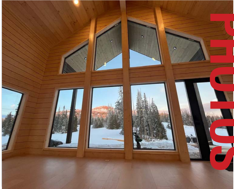
20 ft high ceilings and a loft overlooking the first floor.