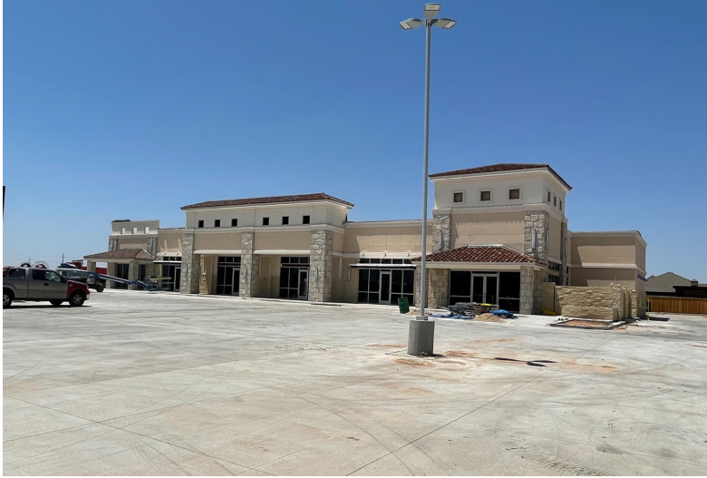
128TH Street Shopping Center UNDER CONSTRUCTION