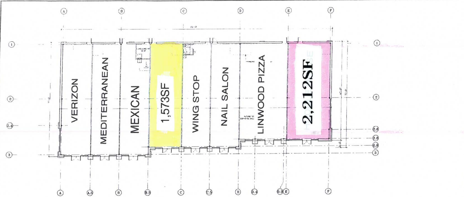
01 LEASE PLAN SCALE 1/8" = 1'-0" N TRUE PROJECT