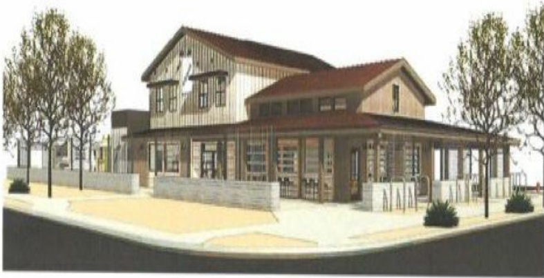
19th and Hemlock Irg