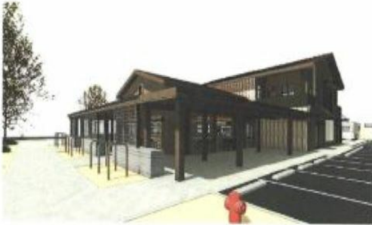
South Alley Irg