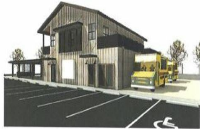
Alley - Office Stair Perspective Irg