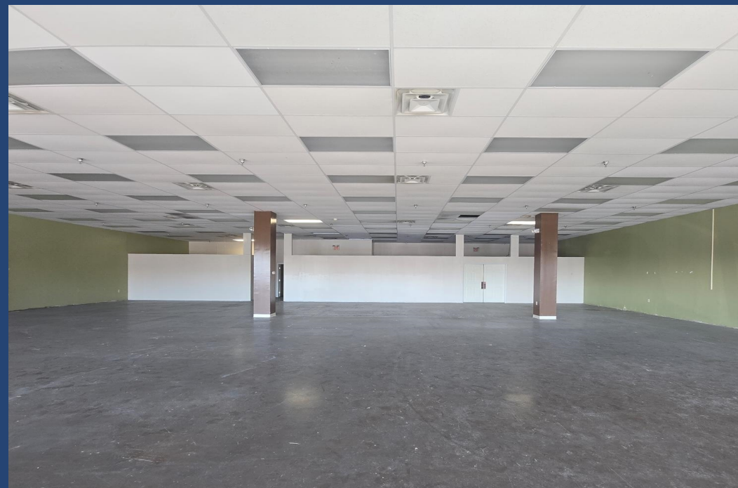
Suite 114 - Interior