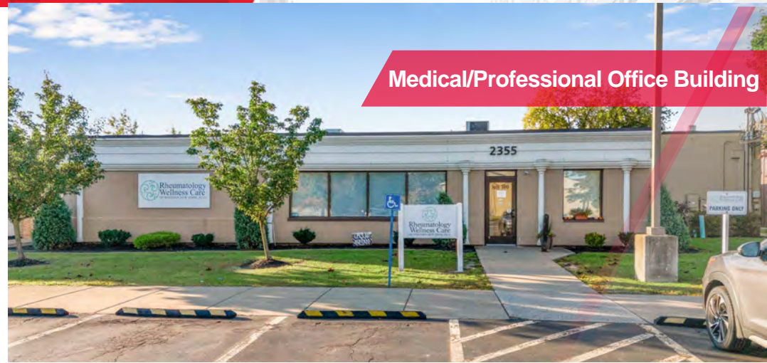
Medical/Professional Office Building