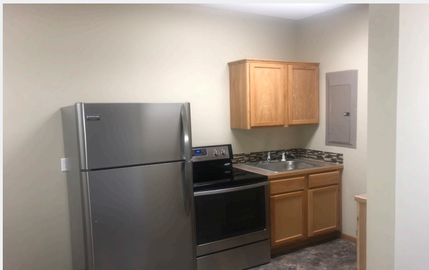
New Kitchen Area