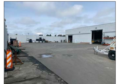
YARD WITH OVERSIZED DOOR