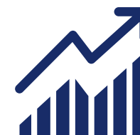
HIGH RETAIL EXPENDITURE