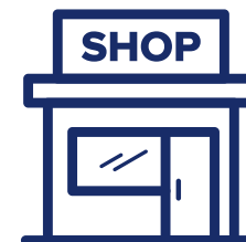
HEAVY RETAIL CORRIDOR