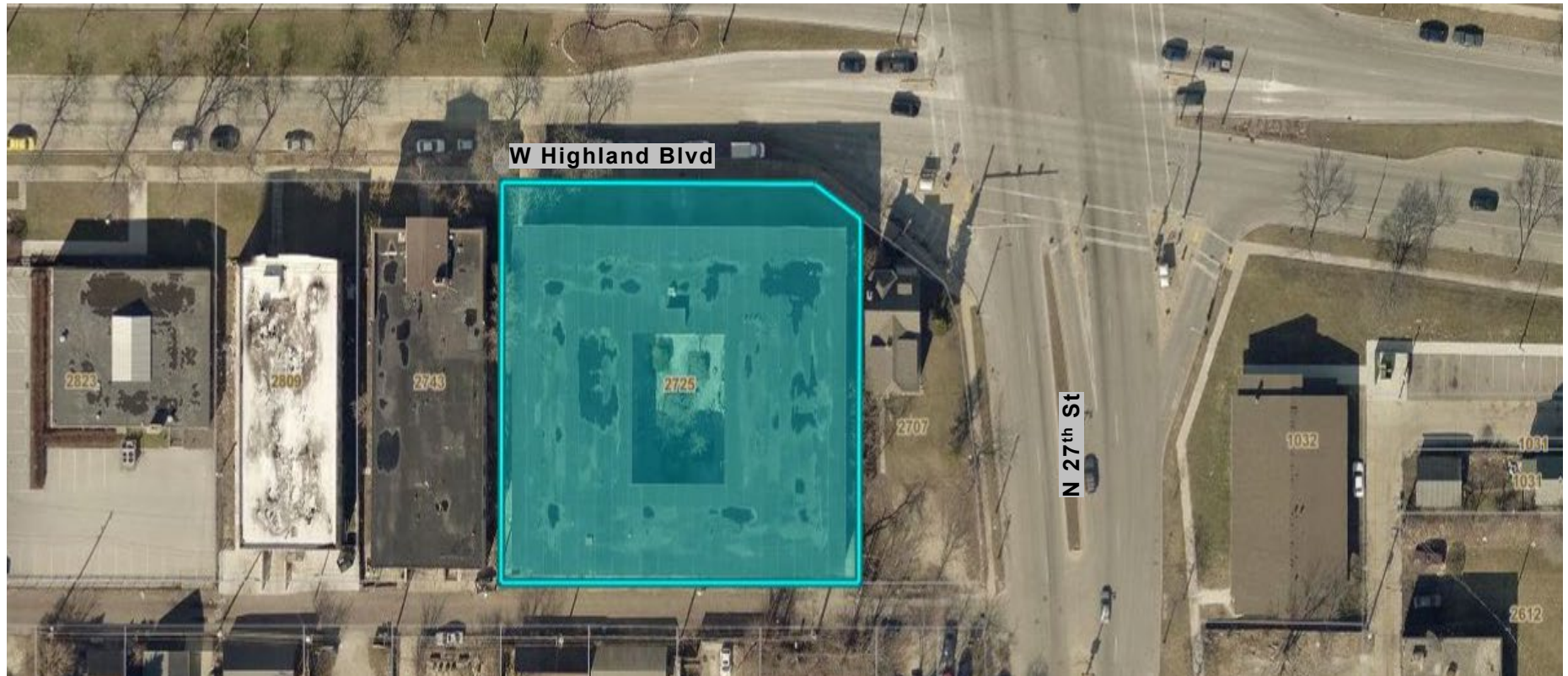
2725 W HIGHLAND BLVD