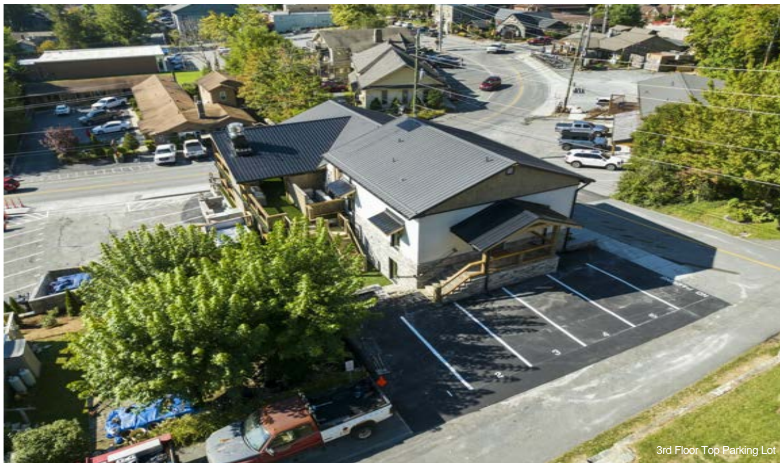
3rd Floor Top Parking Lot