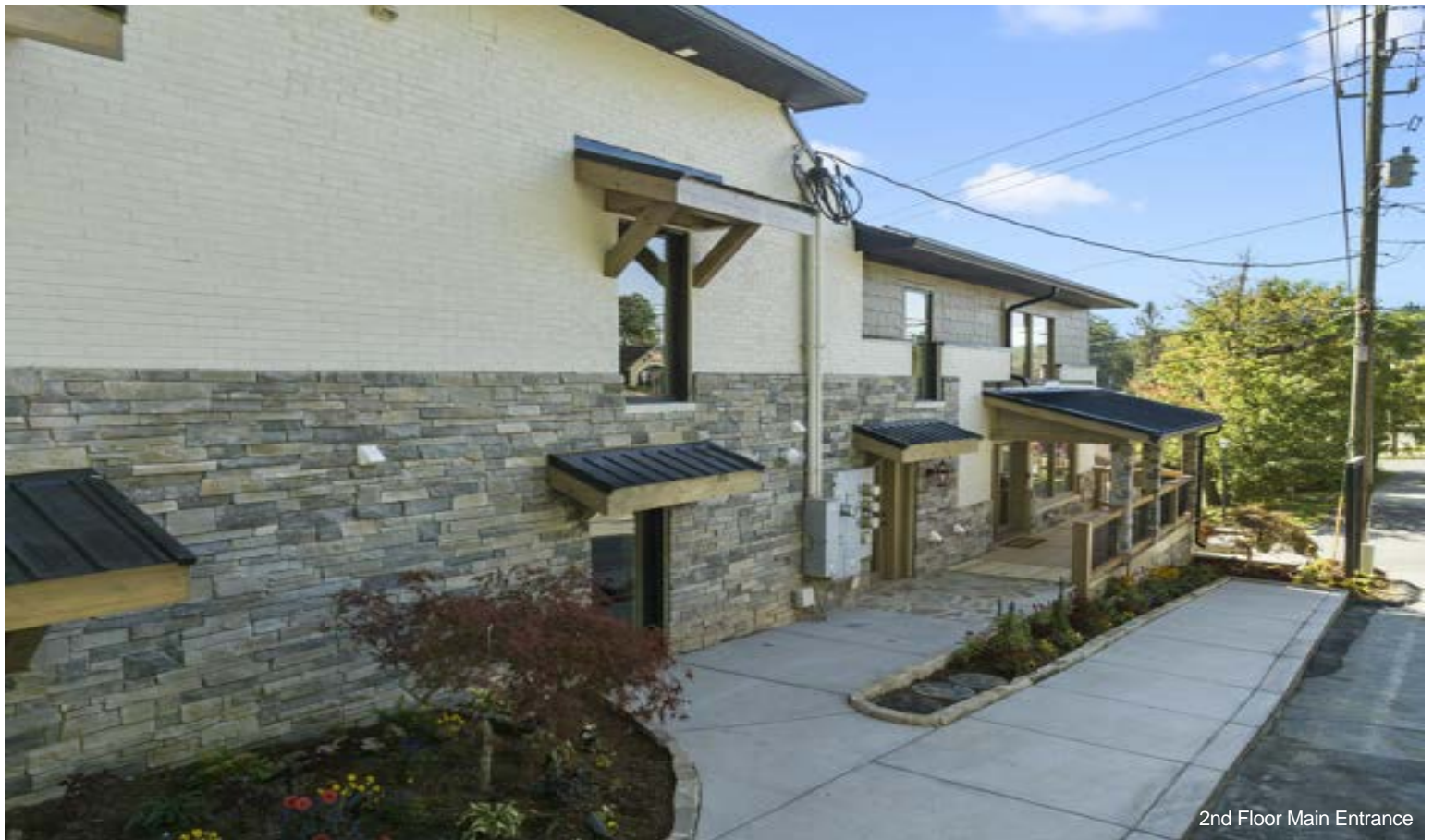
2nd Floor Main Entrance