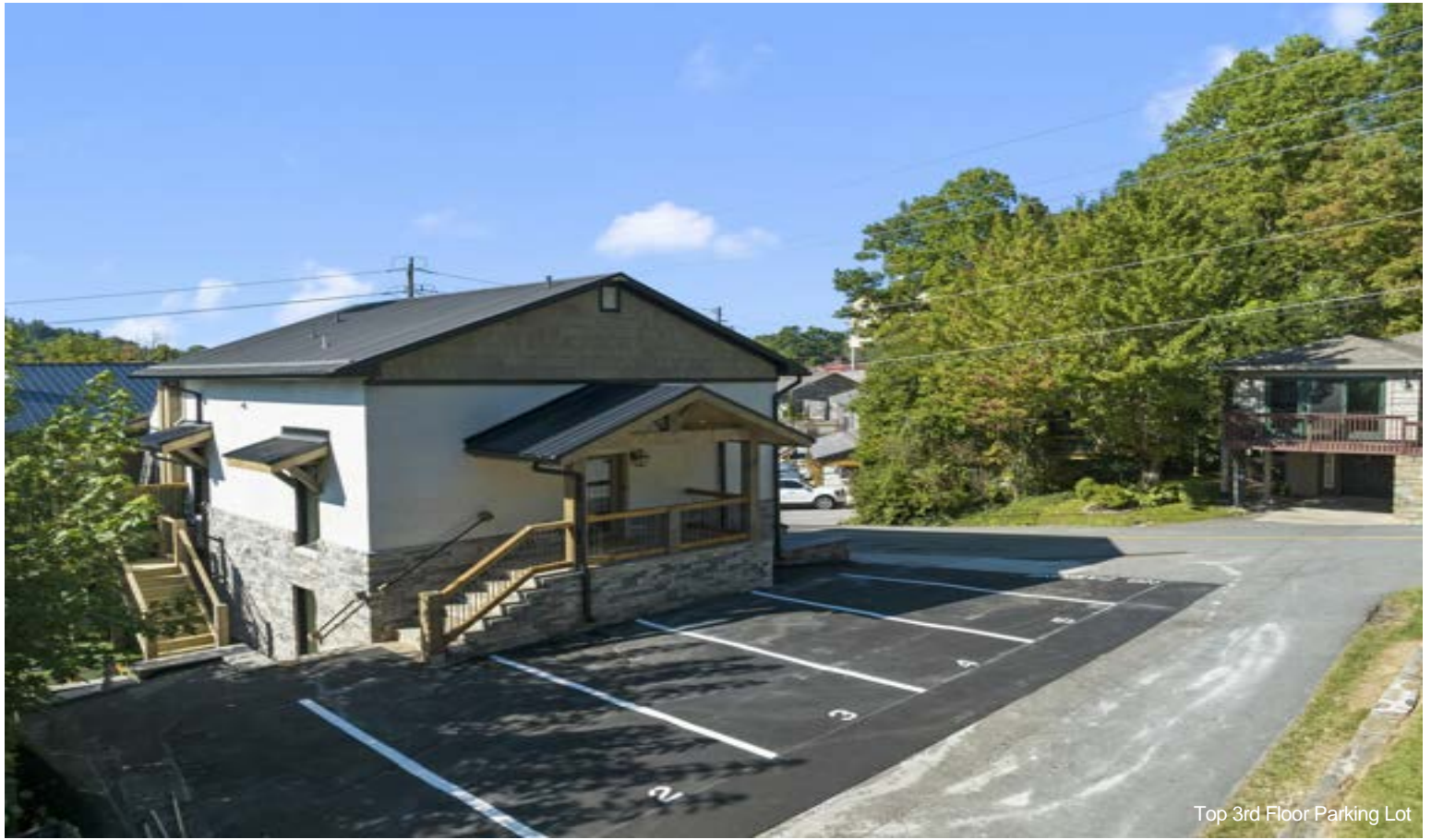
Top 3rd Floor Parking Lot