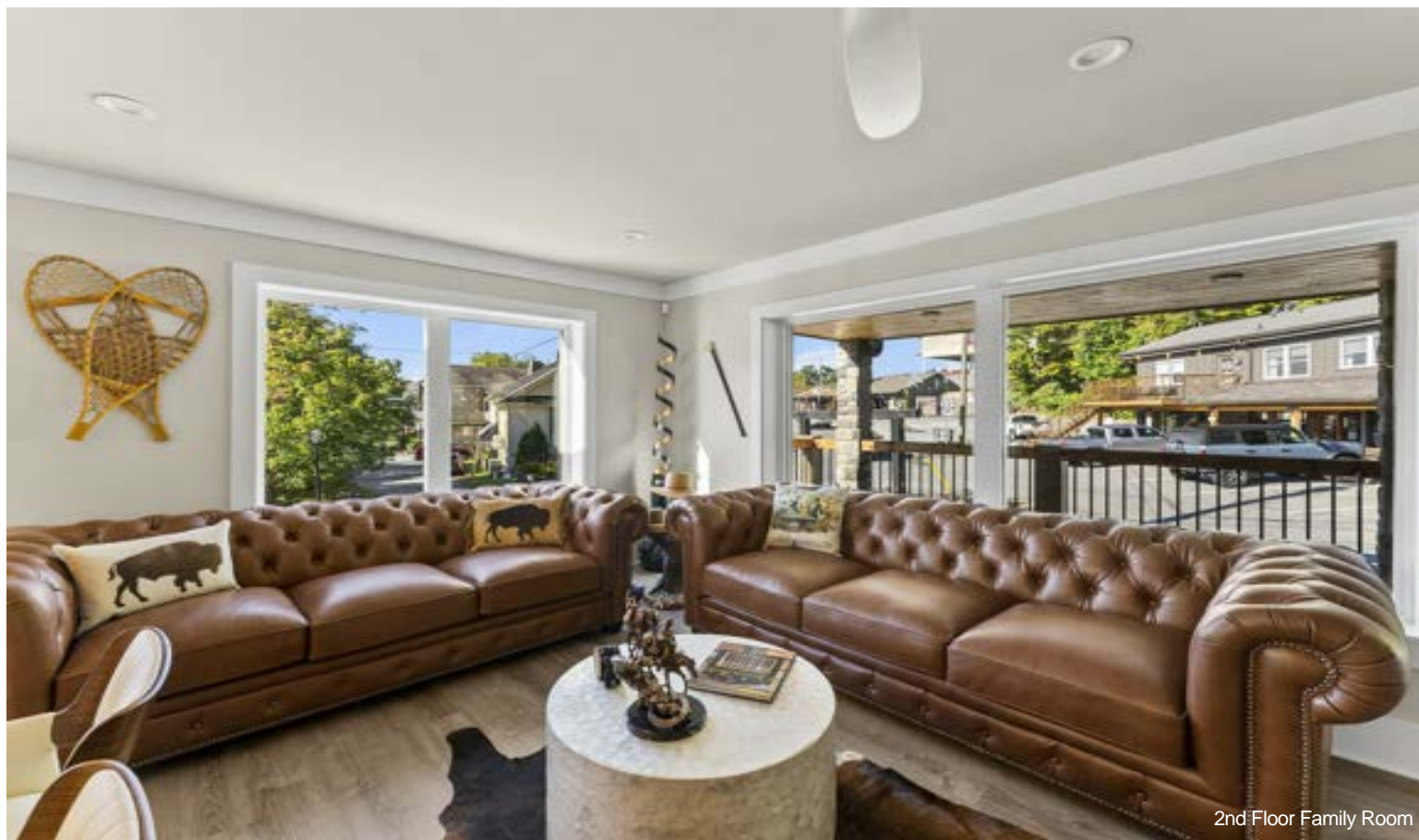
2nd Floor Family Room