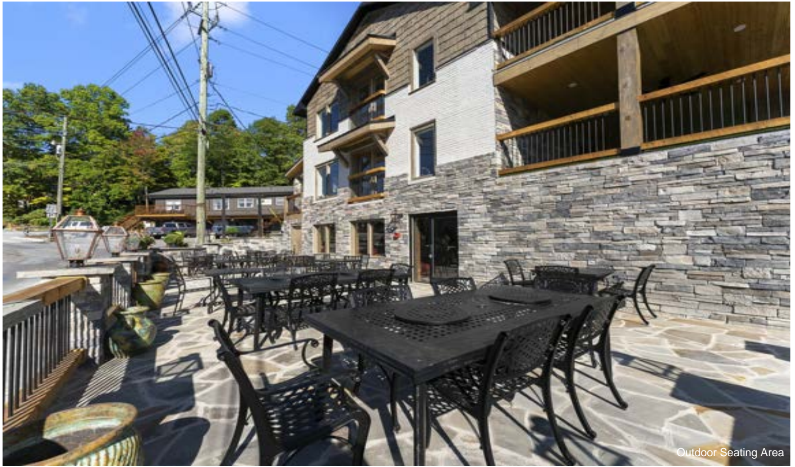
Outdoor Seating Area