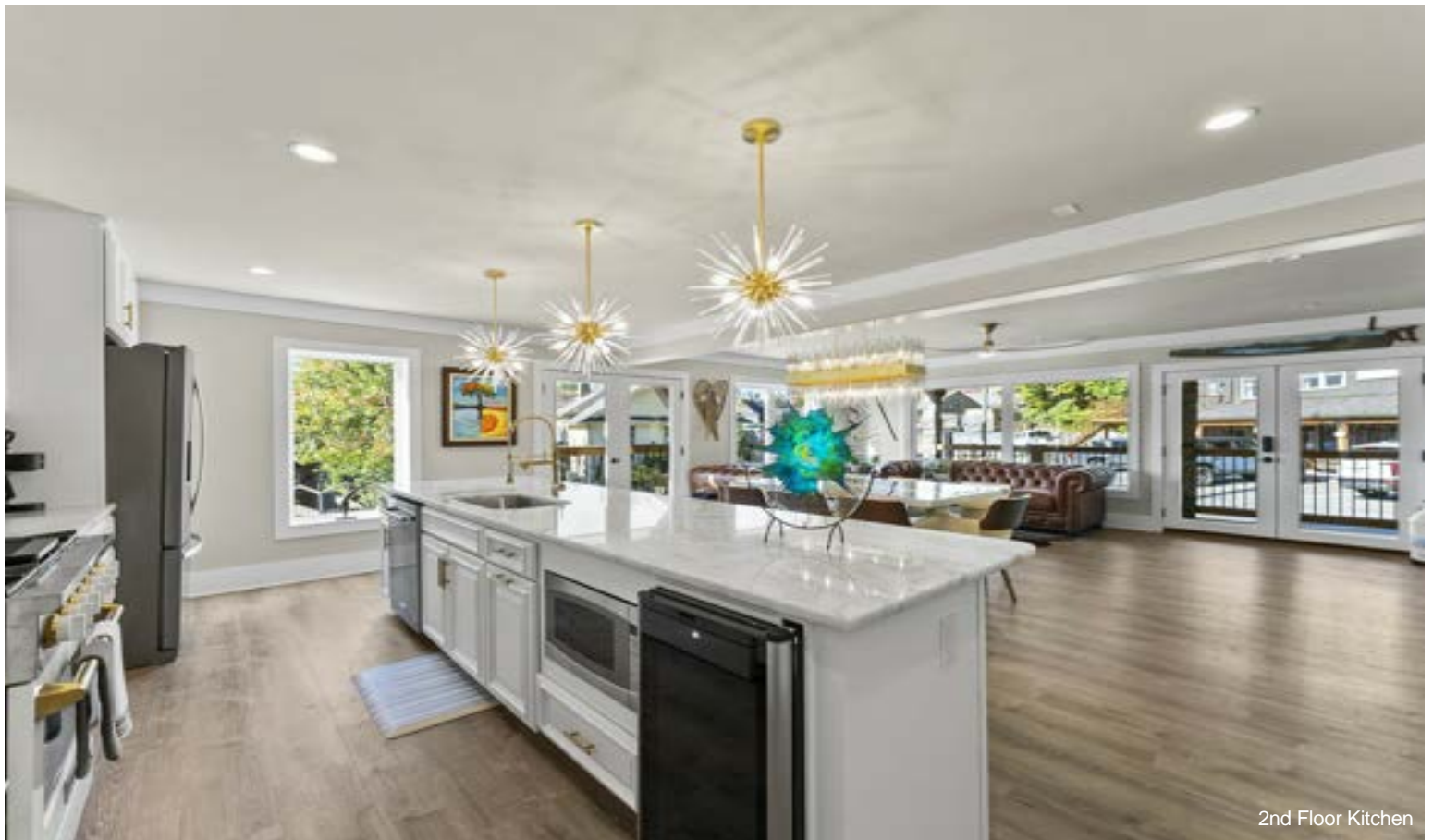
2nd Floor Kitchen