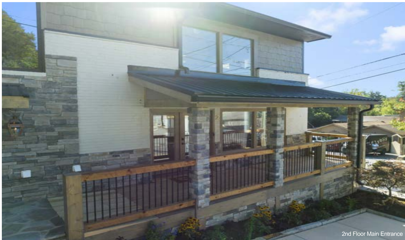
2nd Floor Main Entrance