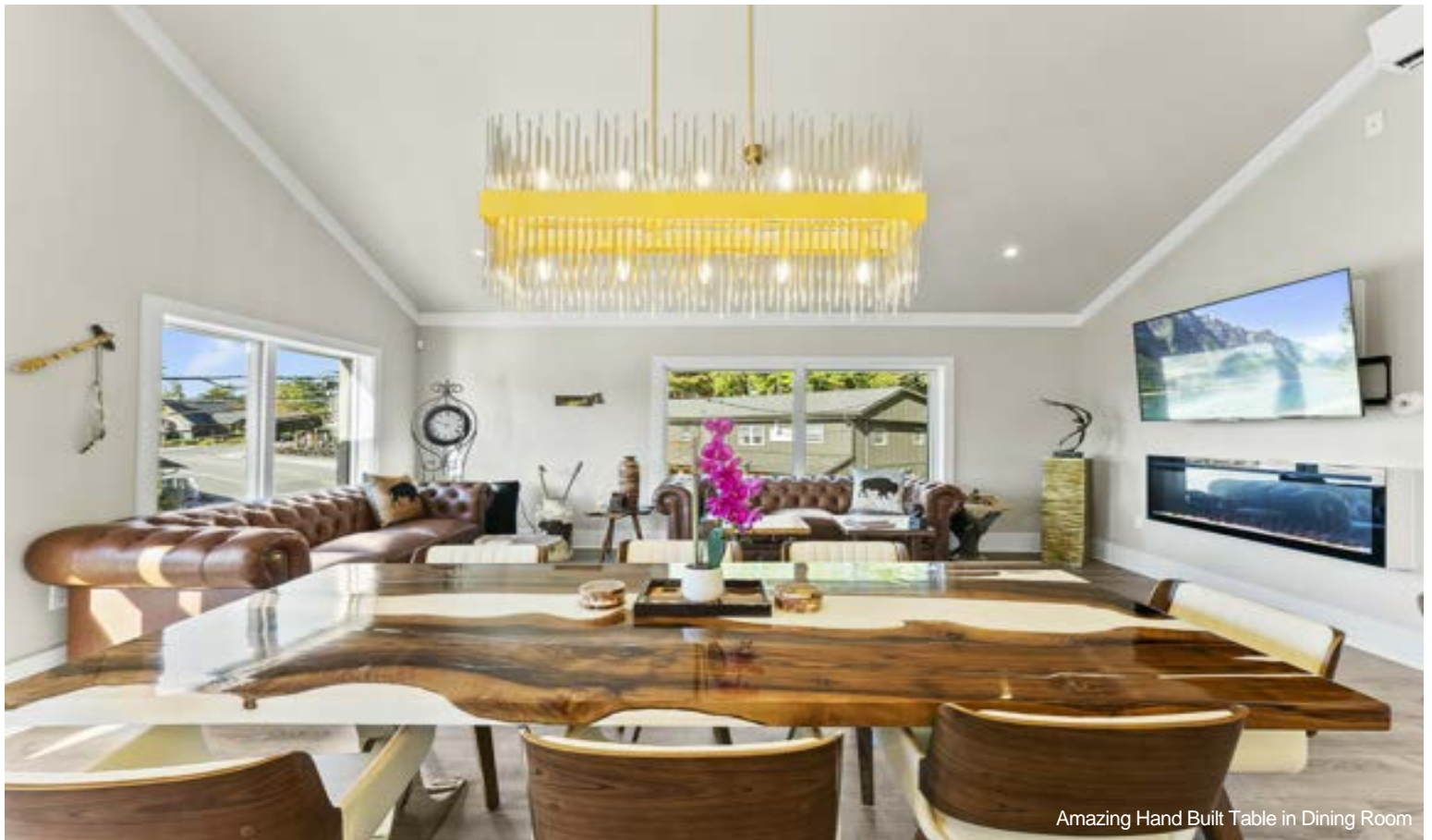
Amazing Hand Built Table in Dining Room