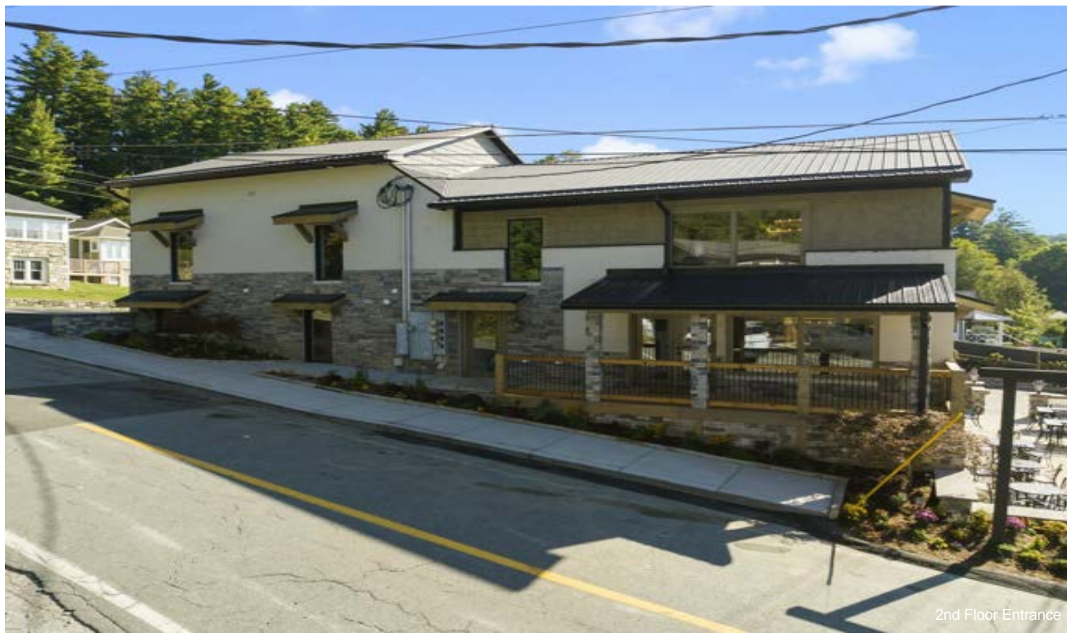
2nd Floor Entrance