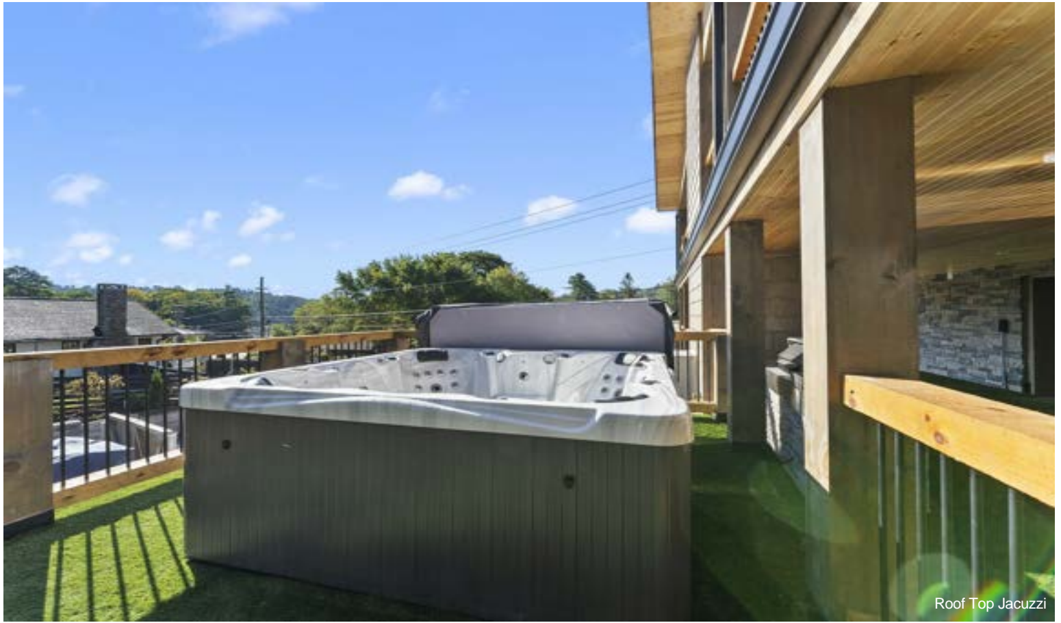
Roof Top Jacuzzi