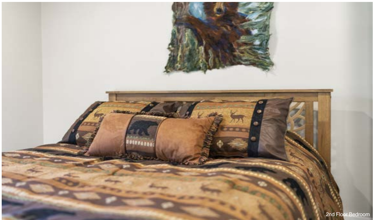
2nd Floor Bedroom