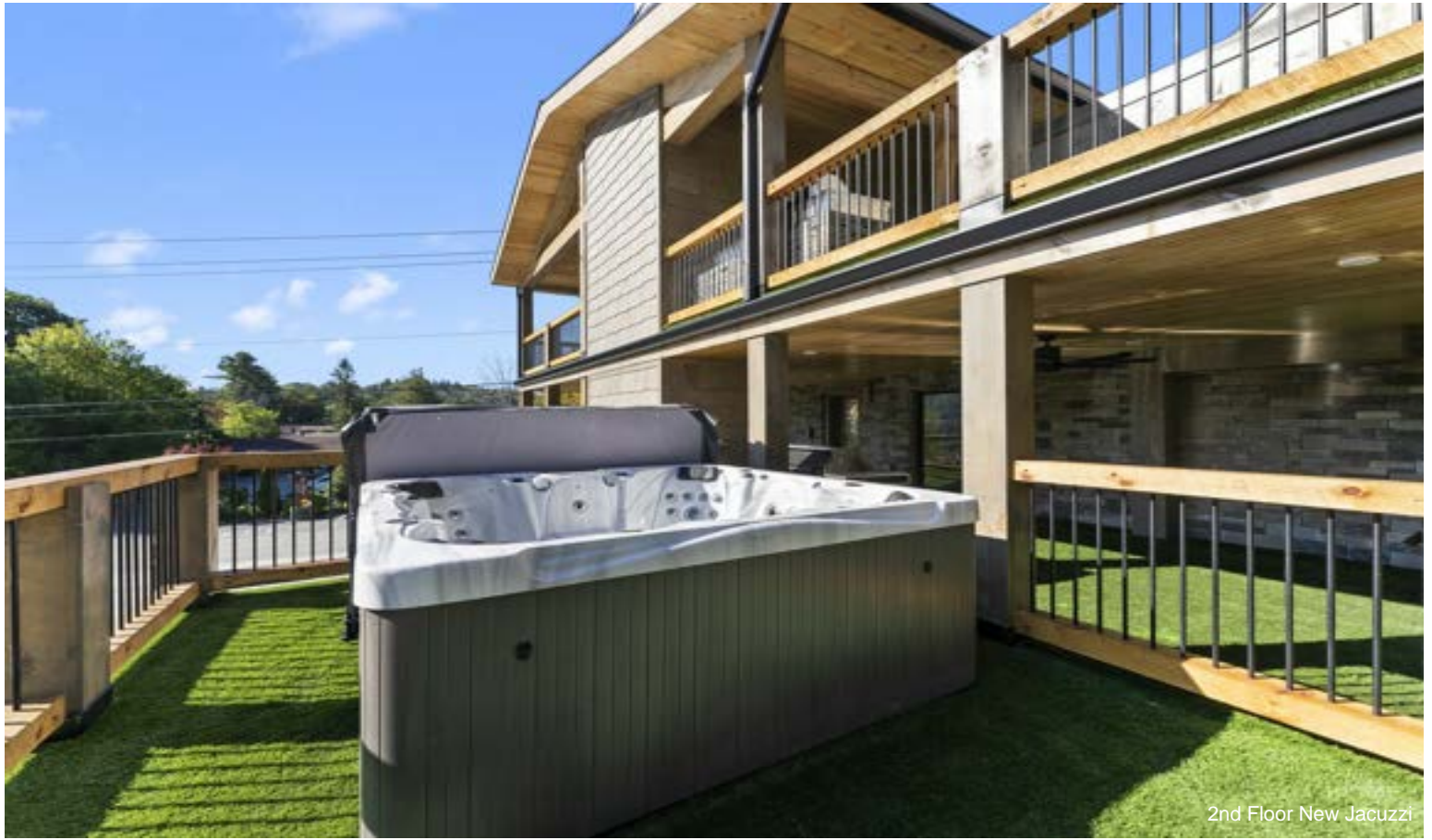
2nd Floor New Jacuzzi