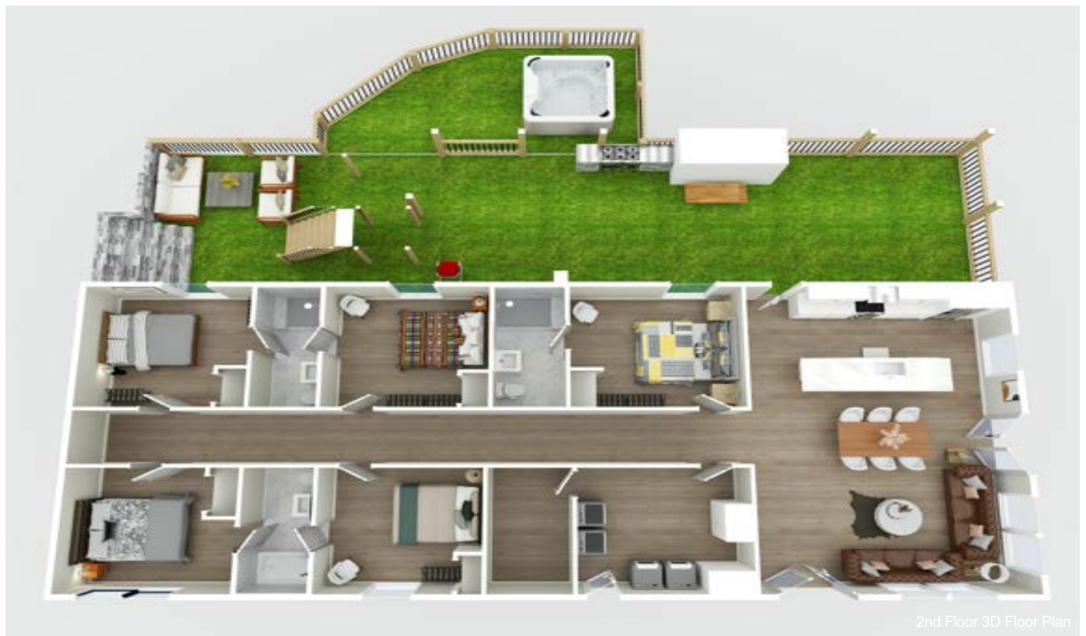
2nd Floor 3D Floor Plan