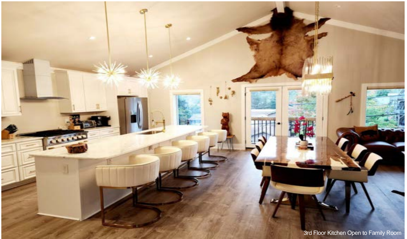
3rd Floor Kitchen Open to Family Room