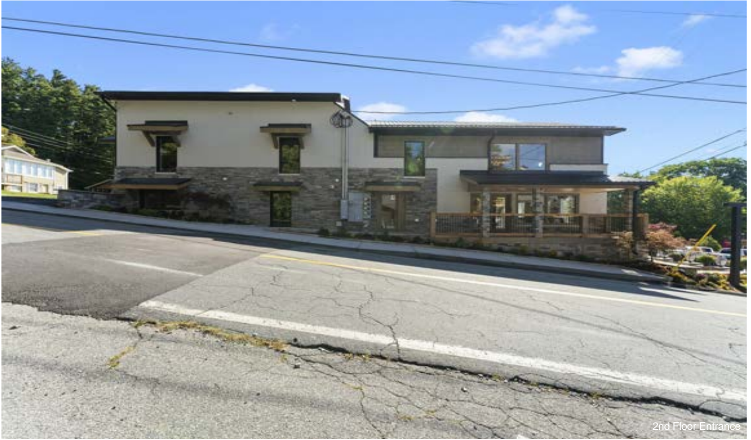
2nd Floor Entrance