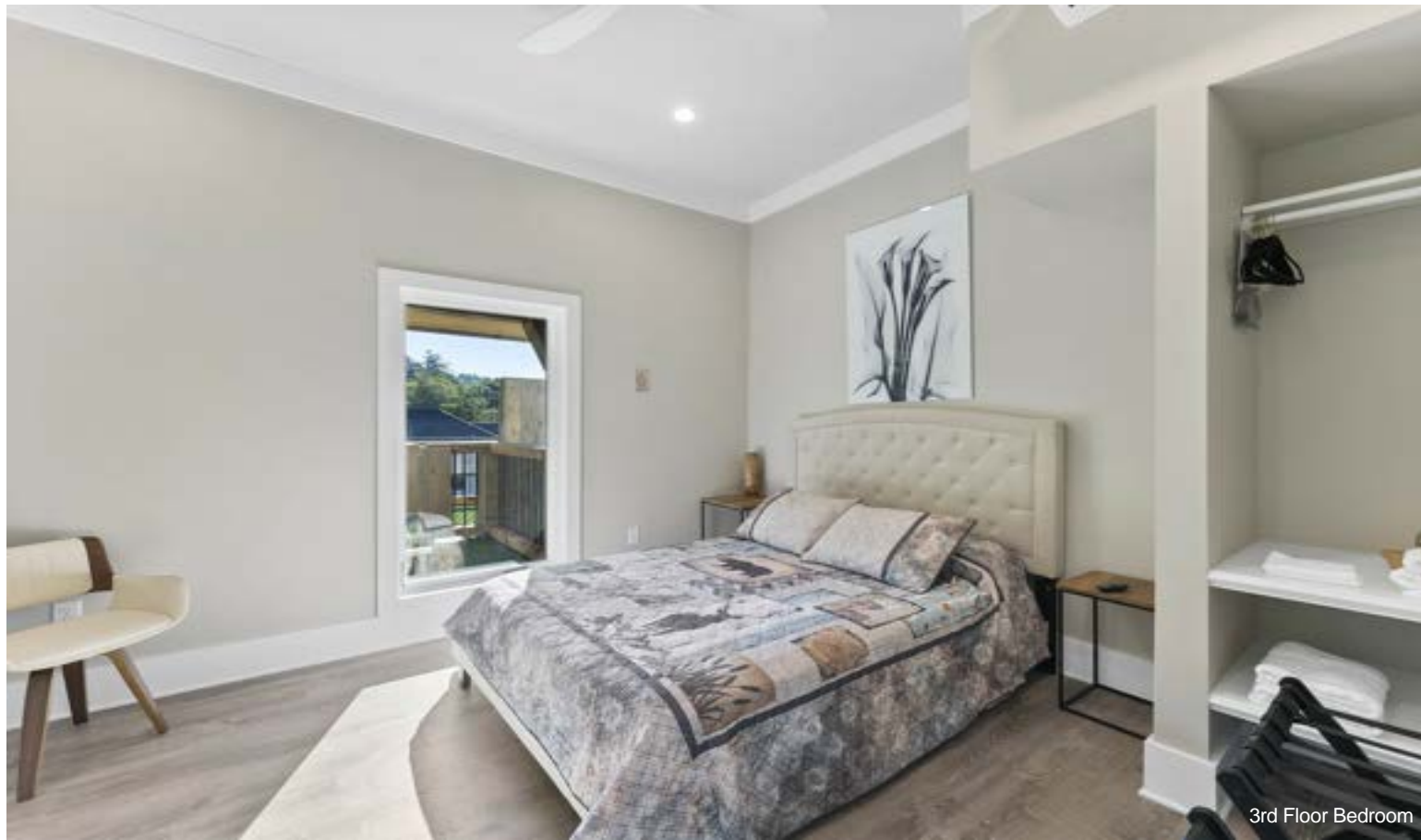
3rd Floor Bedroom