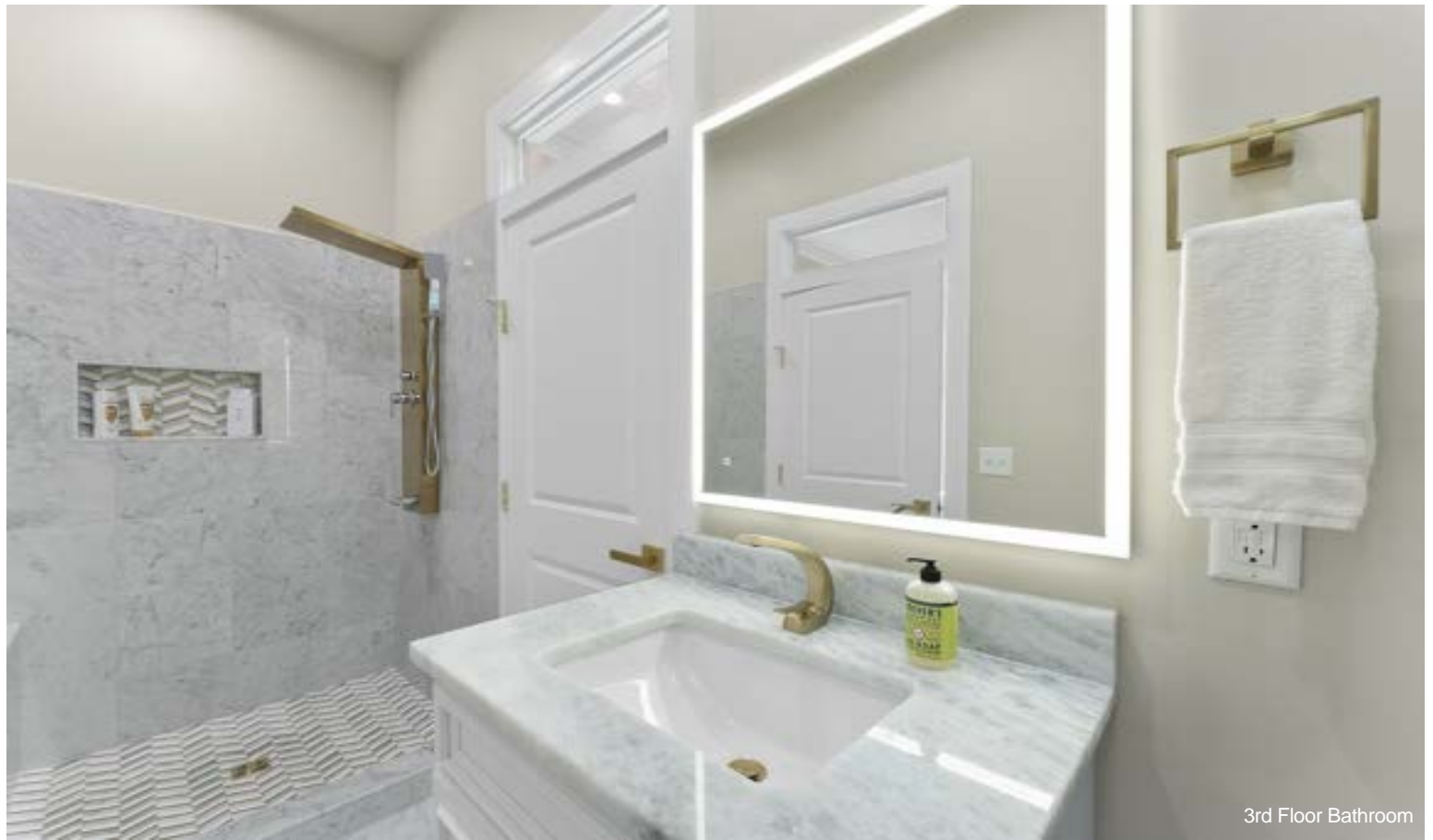
3rd Floor Bathroom