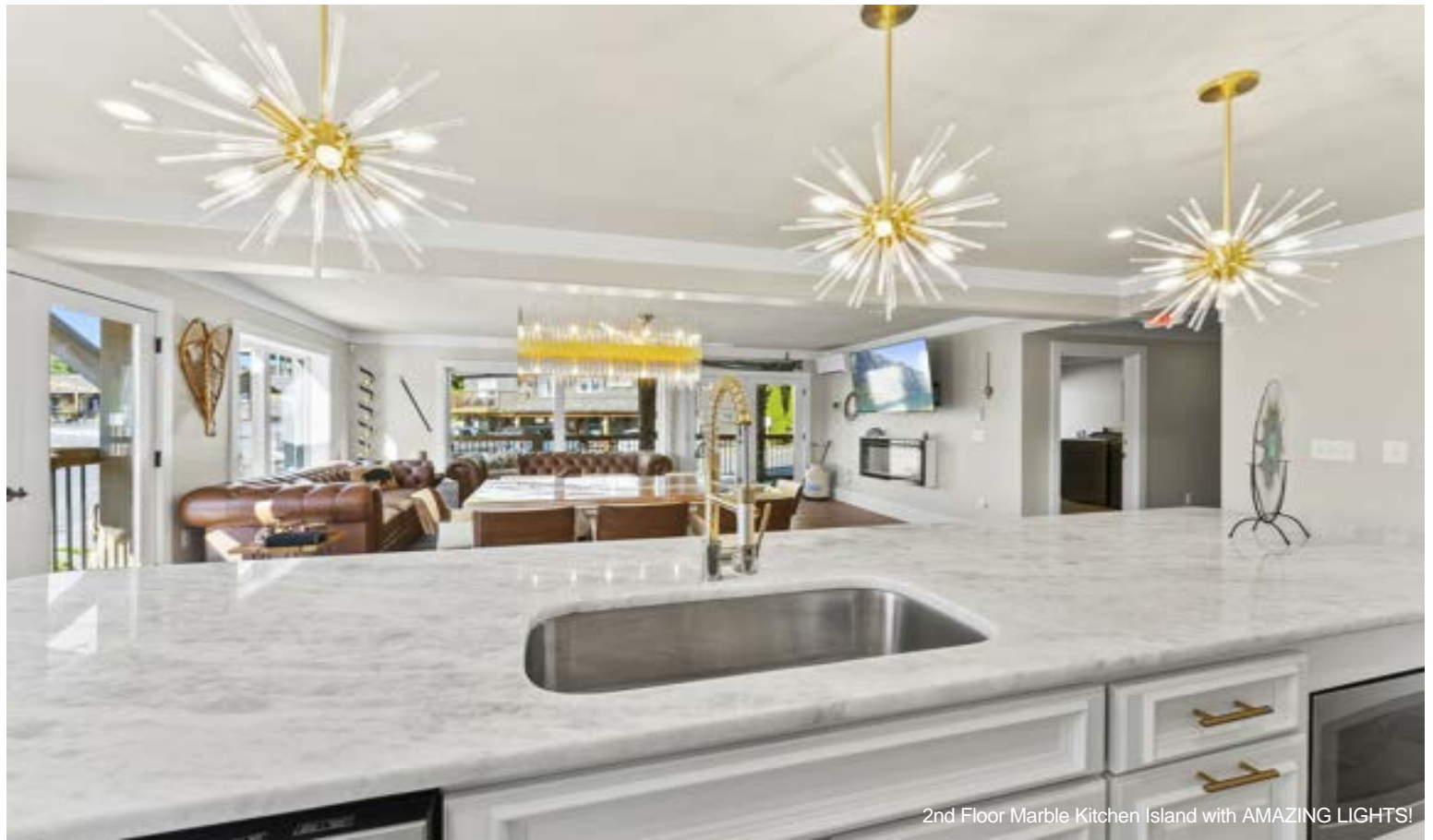
2nd Floor Marble Kitchen Island with AMAZING LIGHTS!