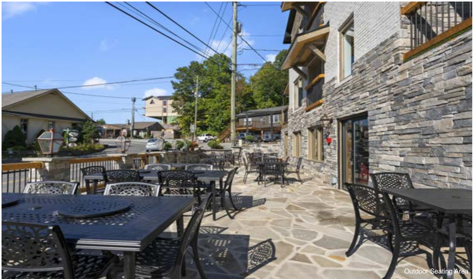
Outdoor Seating Area