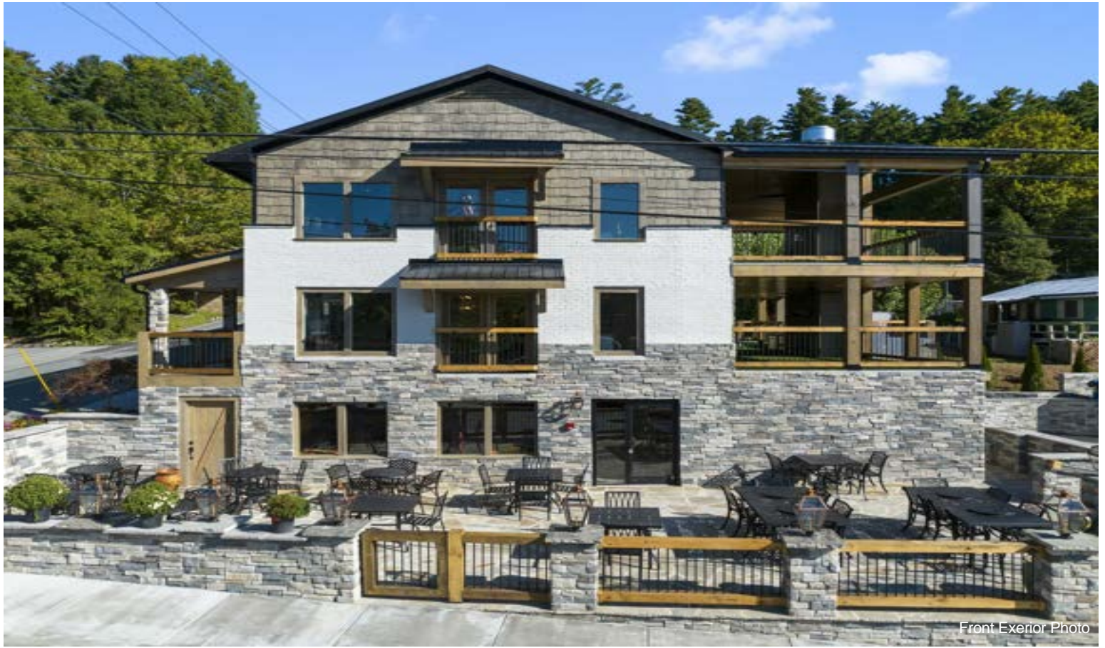
Front Exterior Photo