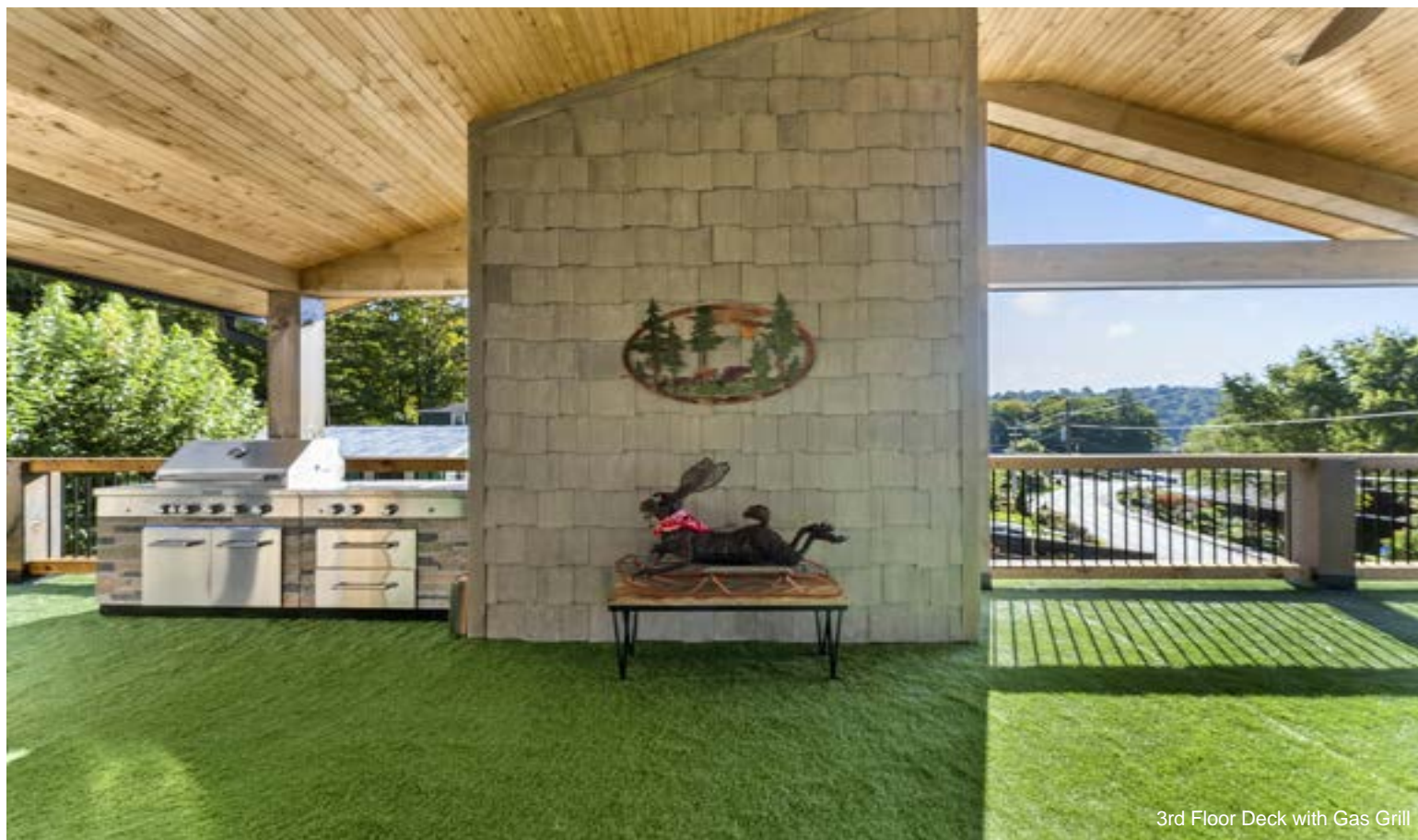
3rd Floor Deck with Gas Grill