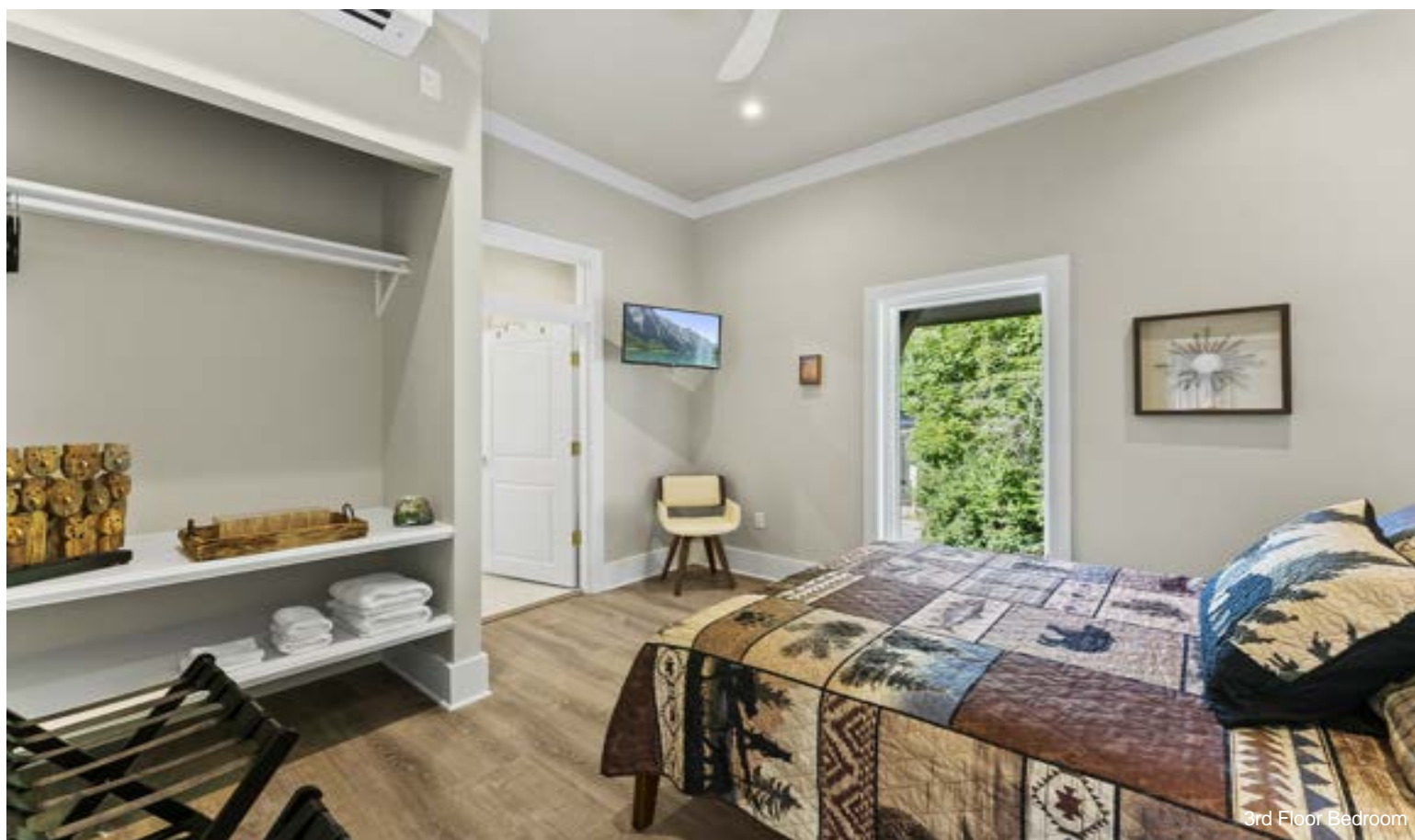
3rd Floor Bedroom