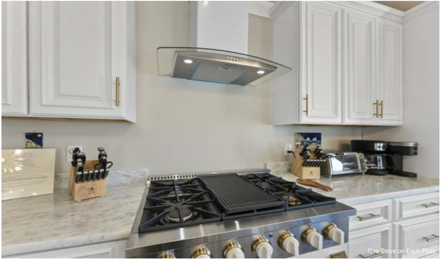
Gas Stove on Each Floor