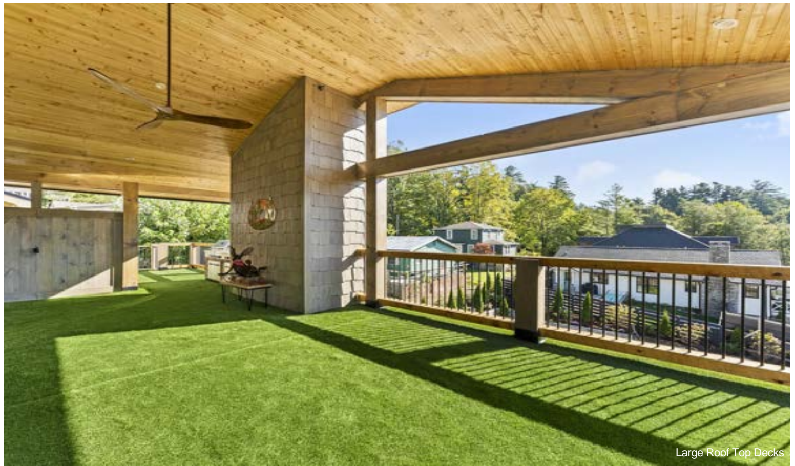
Large Roof Top Decks