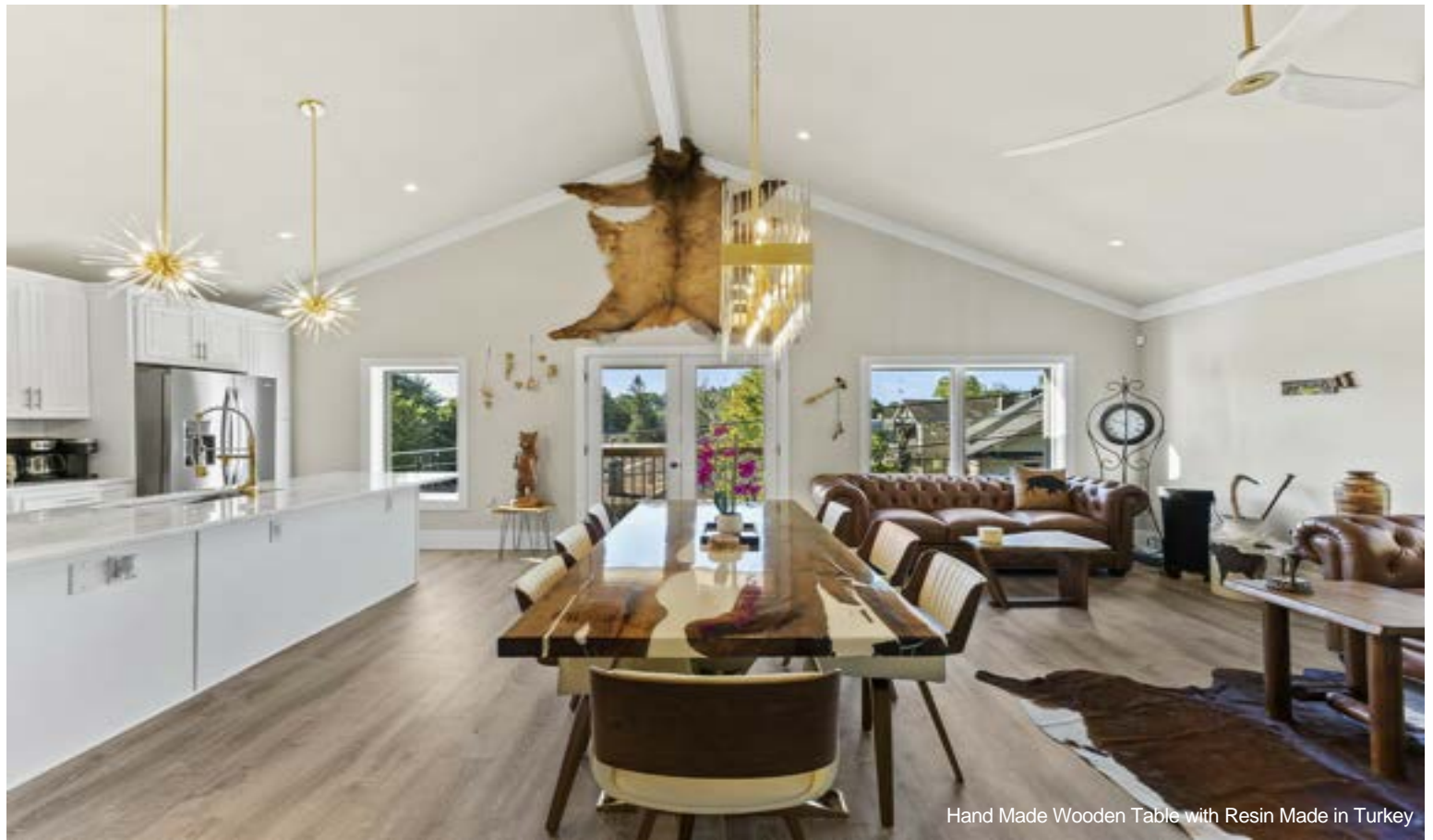
Hand Made Wooden Table with Resin Made in Turkey