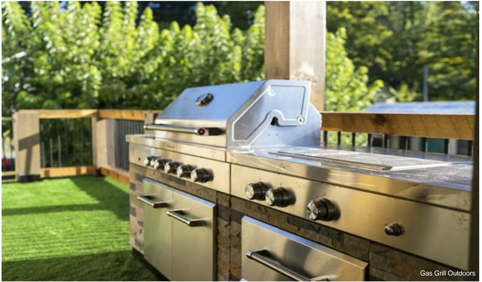
Gas Grill Outdoors