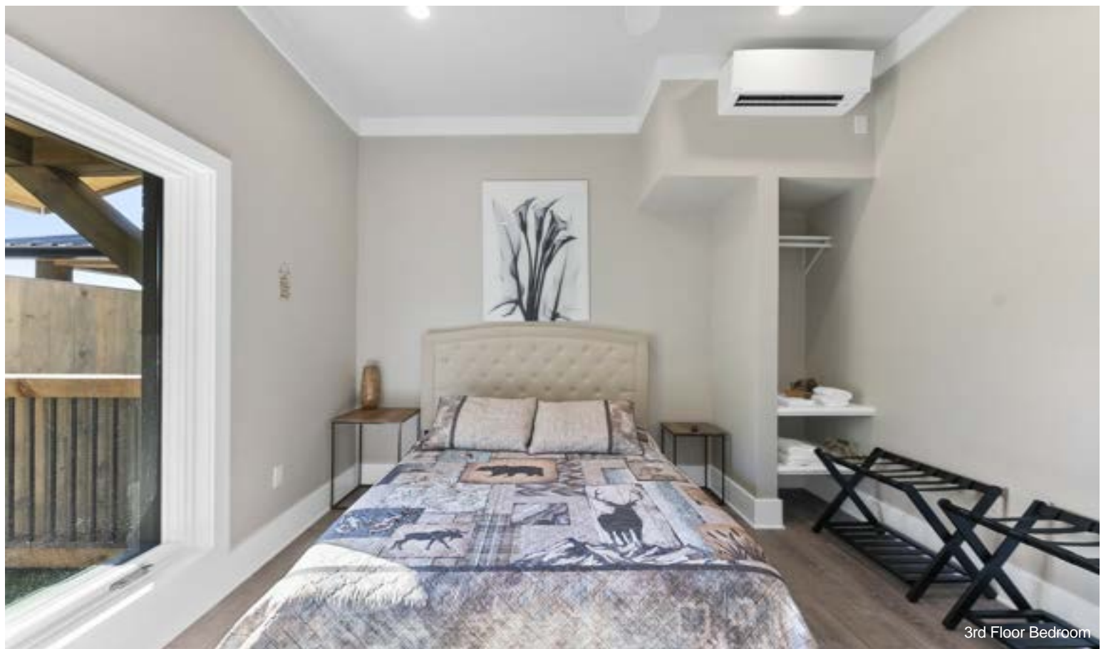
3rd Floor Bedroom