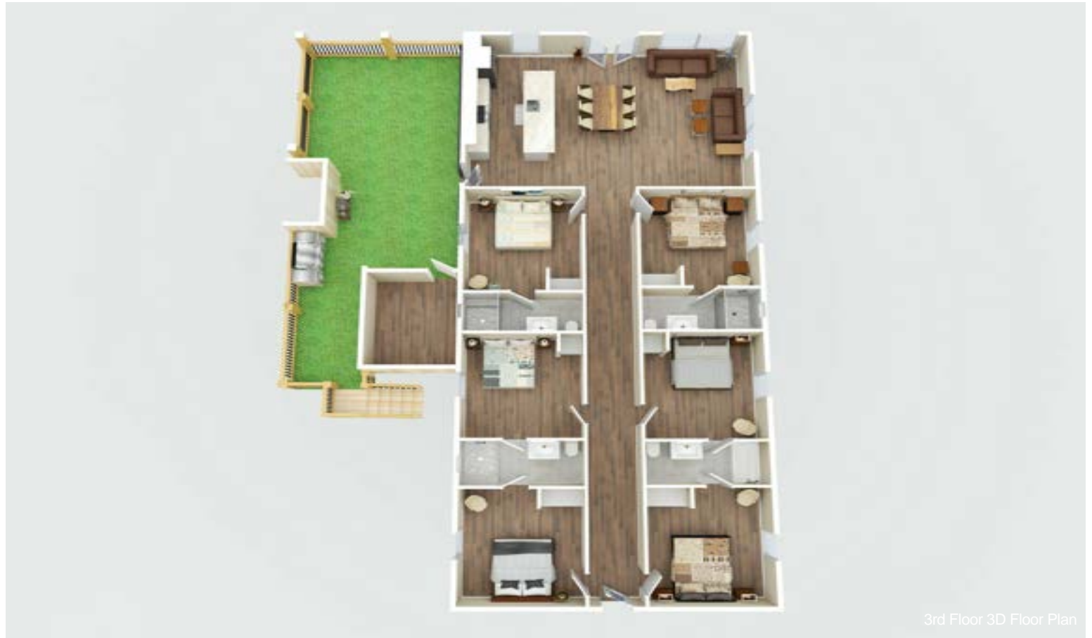
3rd Floor 3D Floor Plan