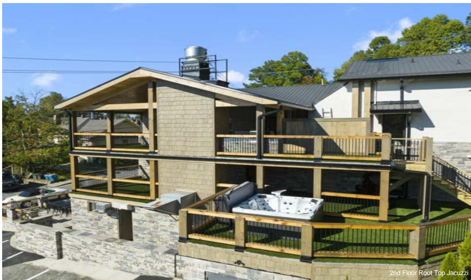
2nd Floor Root Top Jacuzzi