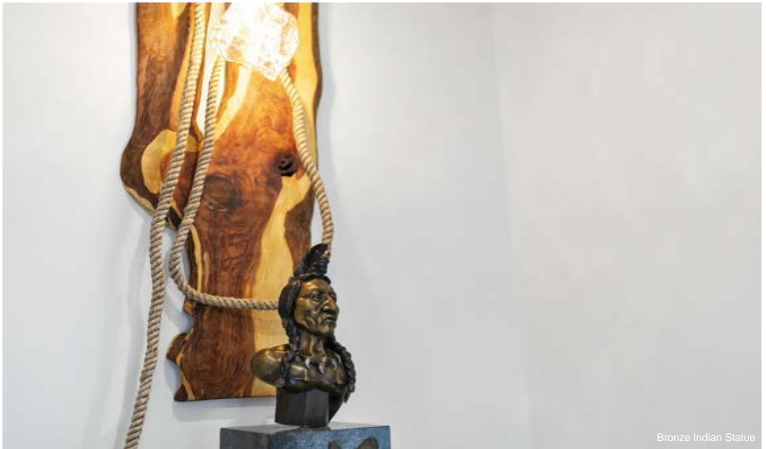
Bronze Indian Statue