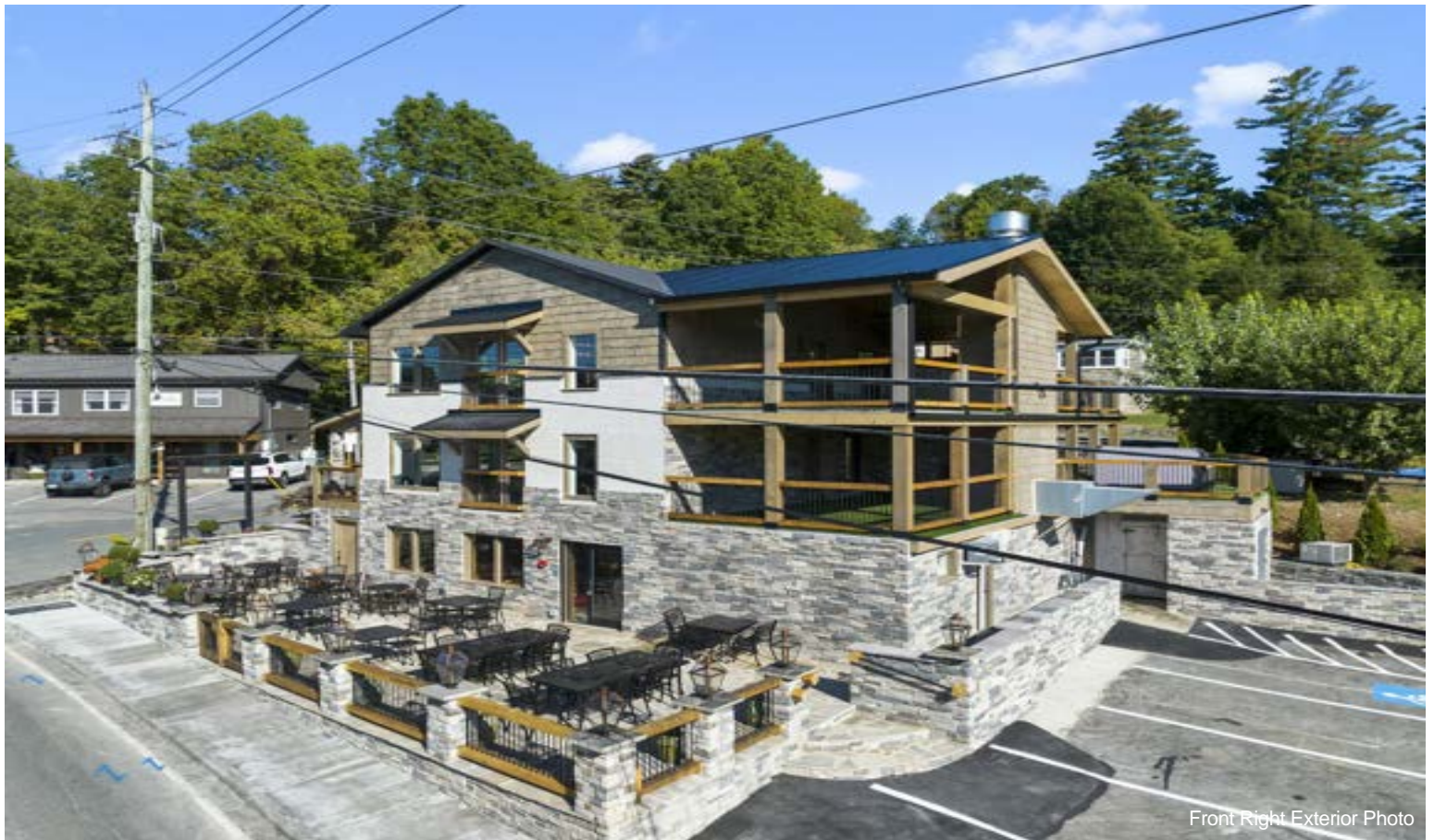
Front Right Exterior Photo