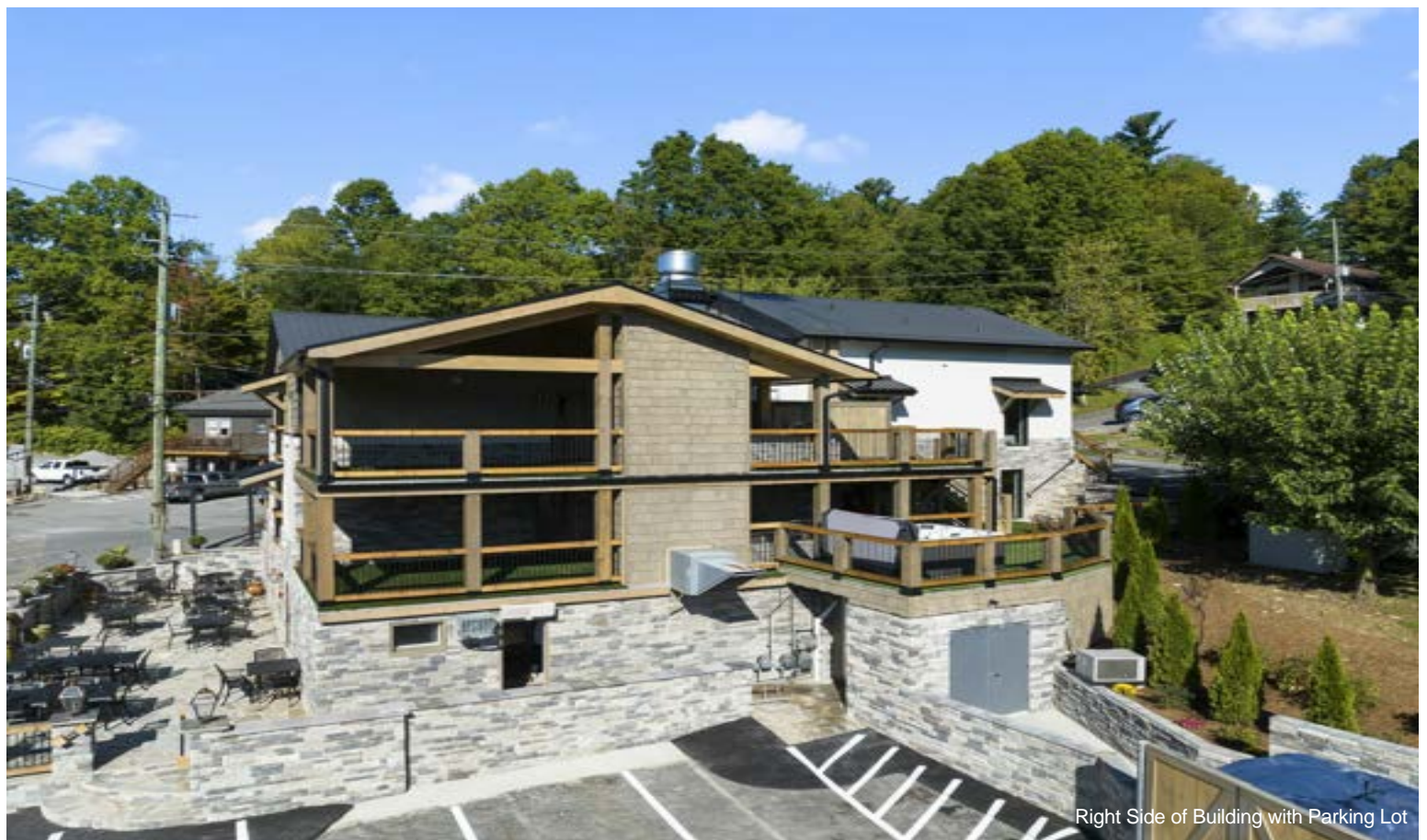
Right Side of Building with Parking Lot