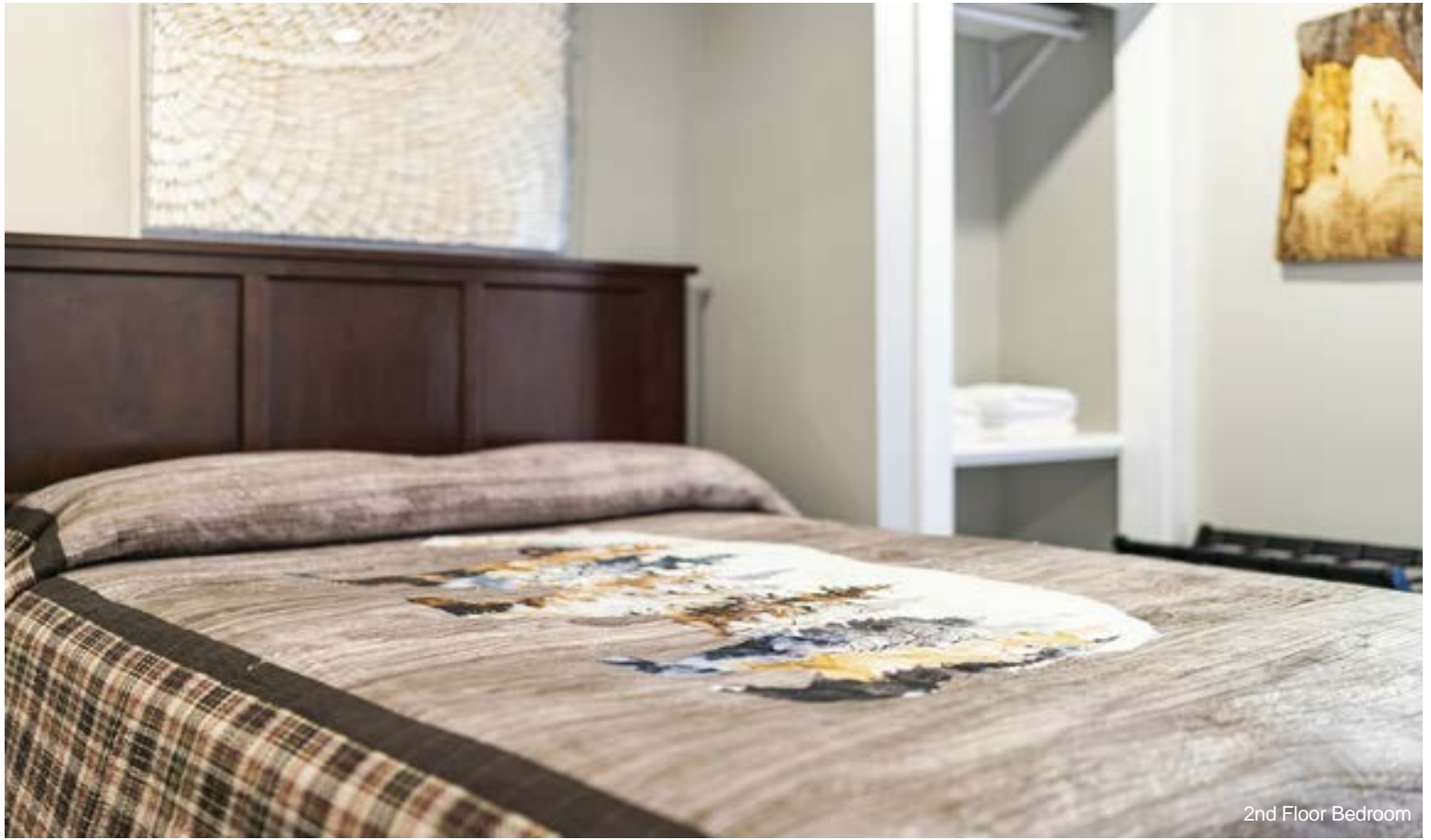
2nd Floor Bedroom