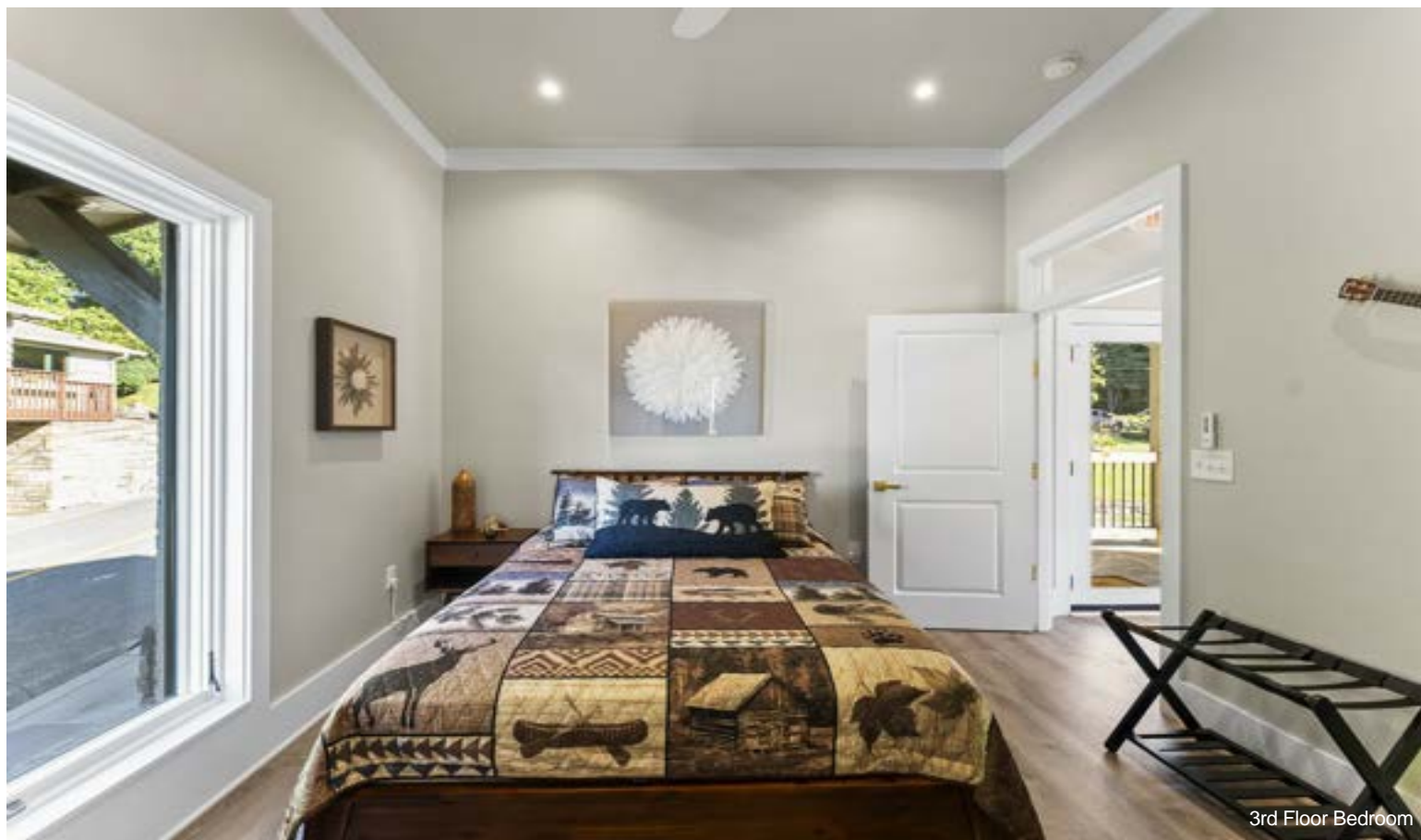
3rd Floor Bedroom