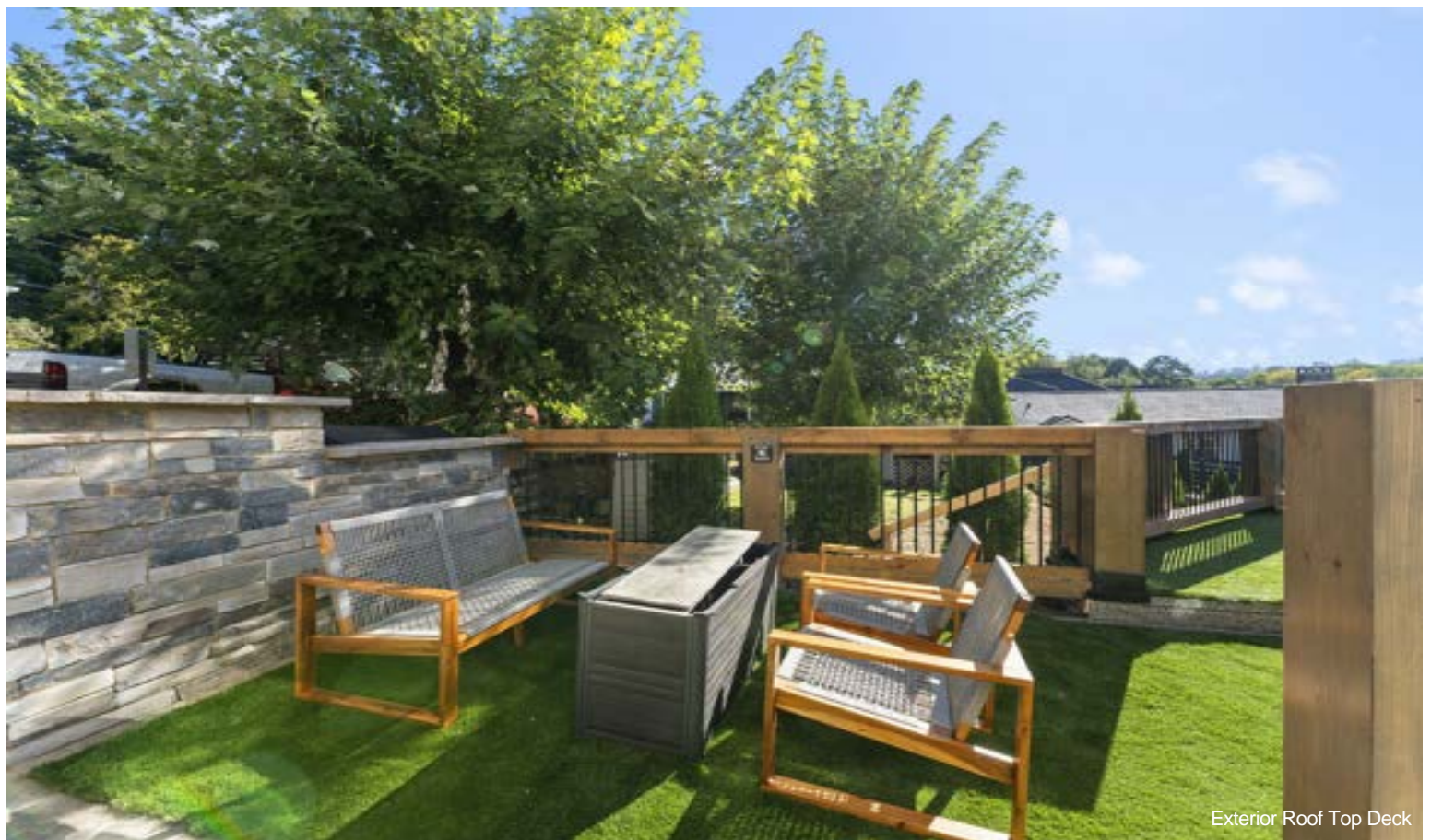
Exterior Roof Top Deck