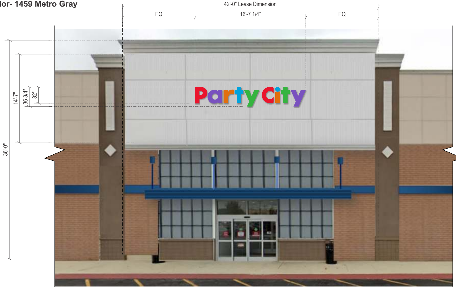
Front Elevation (North)