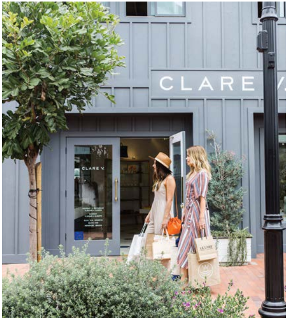
LIDO MARINA VILLAGE