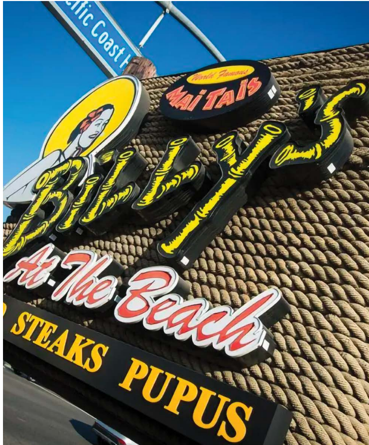
BILLY'S AT THE BEACH