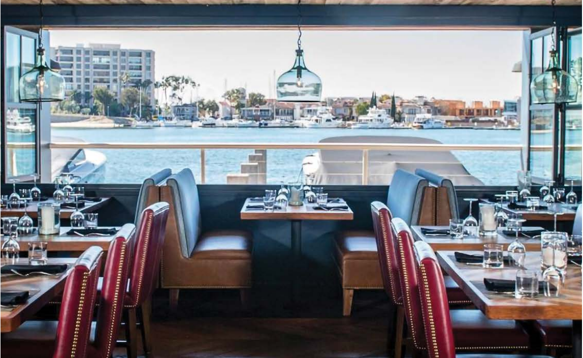
LOUIE'S BY THE BAY