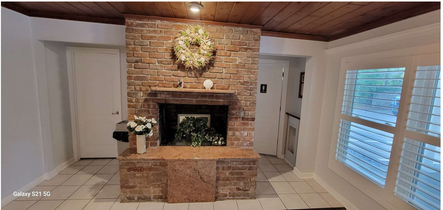
Galaxy S21 5G