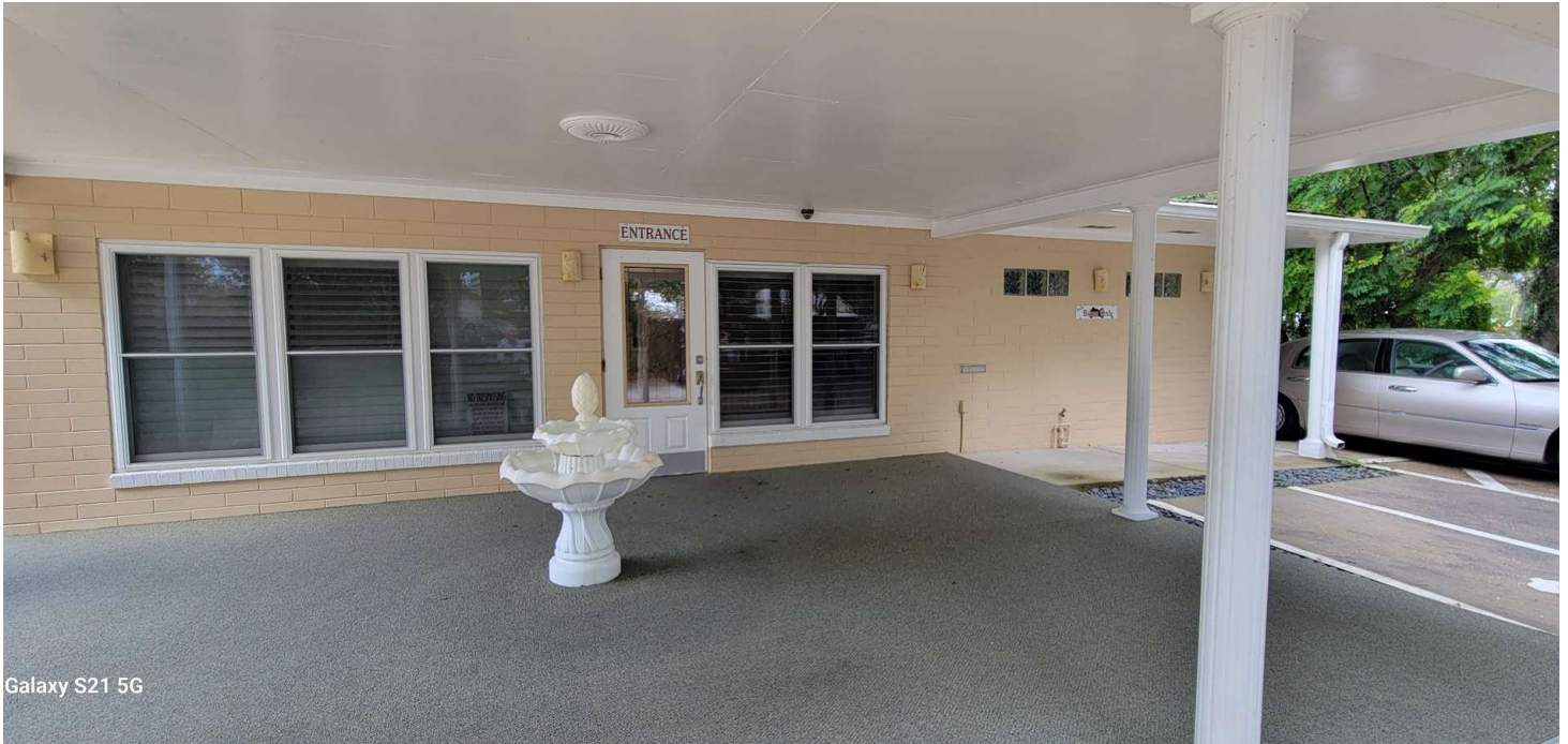
Galaxy S21 5G

1025 New York Avenue West DeLand, FL 32720