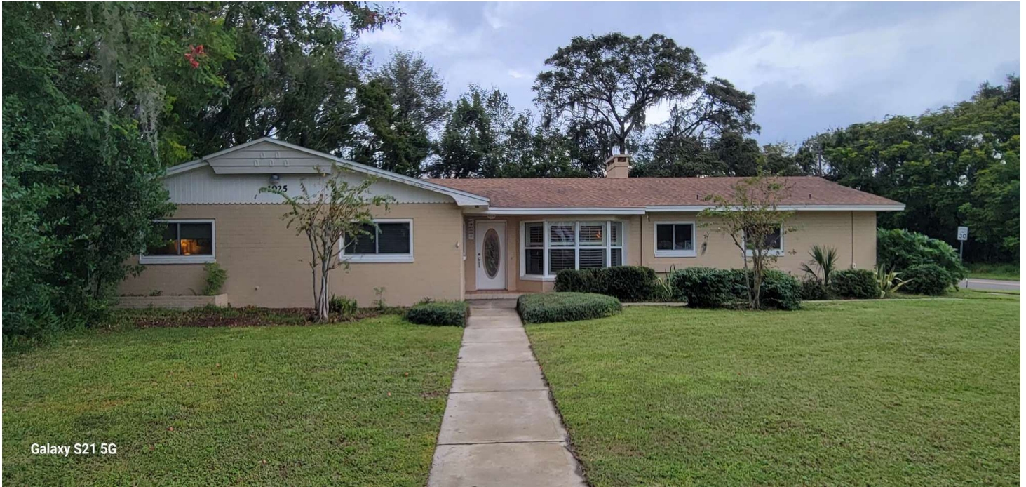
Galaxy S21 5G

1025 New York Avenue West DeLand, FL 32720