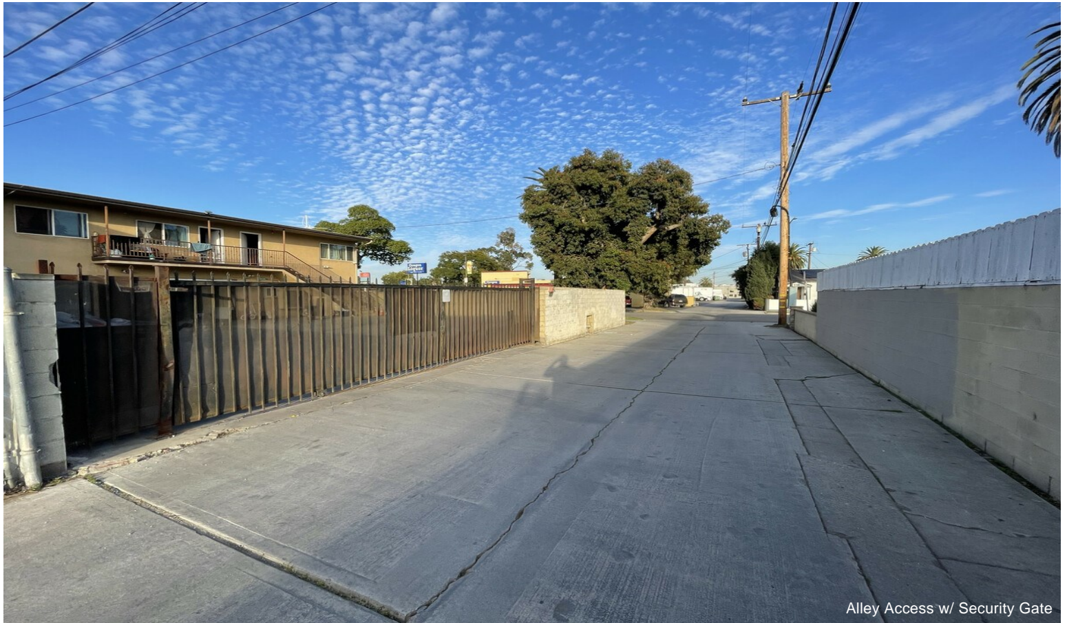
Alley Access w/ Security Gate