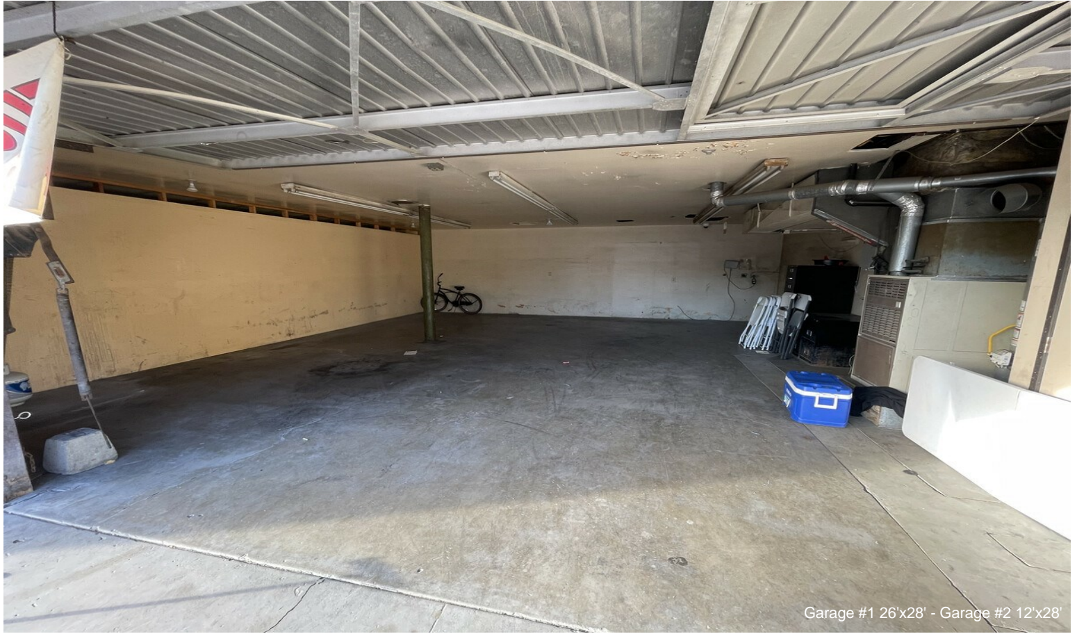
Garage #1 26'x28' - Garage #2 12'x28'