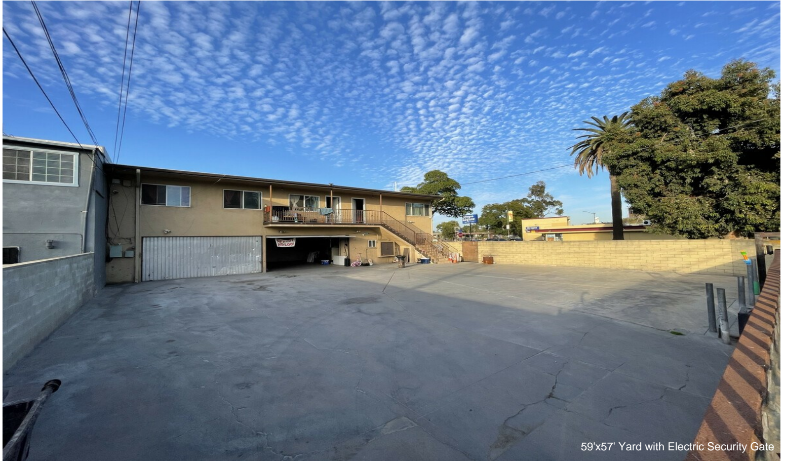
59'x57' Yard with Electric Security Gate