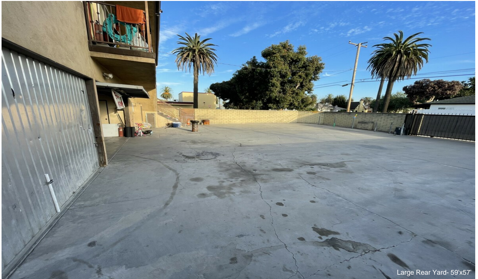
Large Rear Yard- 59'x57'